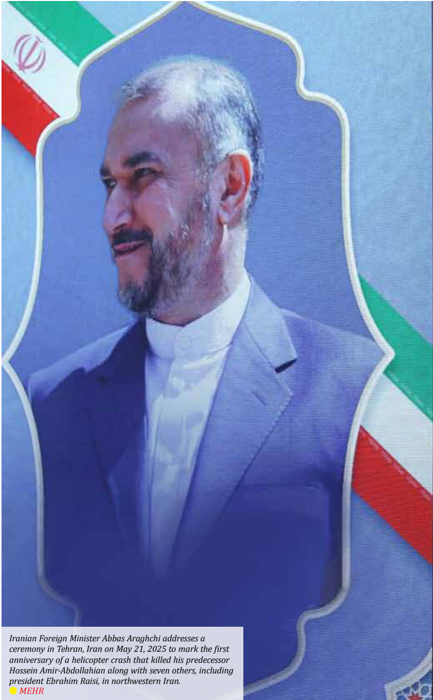
Iranian Foreign Minister Abbas Araghchi addresses a ceremony in Tehran, Iran on May 21, 2025 to mark the first anniversary of a helicopter crash that killed his predecessor Hossein Amir-Abdollahian along with seven others, including president Ebrahim Raisi, in northwestern Iran.