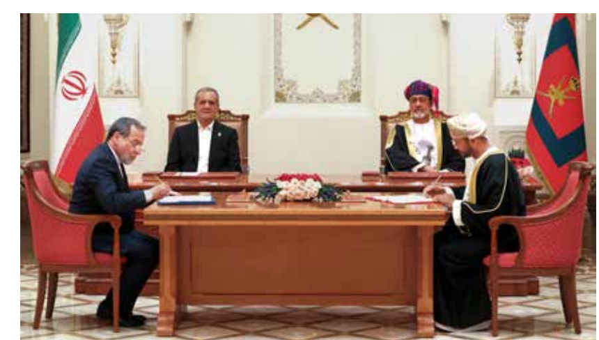
witness a significant leap in their bilateral relations.

"Today, Oman, without relying on oil and gas and by focusing on boosting trade exchanges, is in a favorable position," he said. The Sultan of Oman stressed that if Tehran and Muscat facilitate the activities of their business people, the two countries will