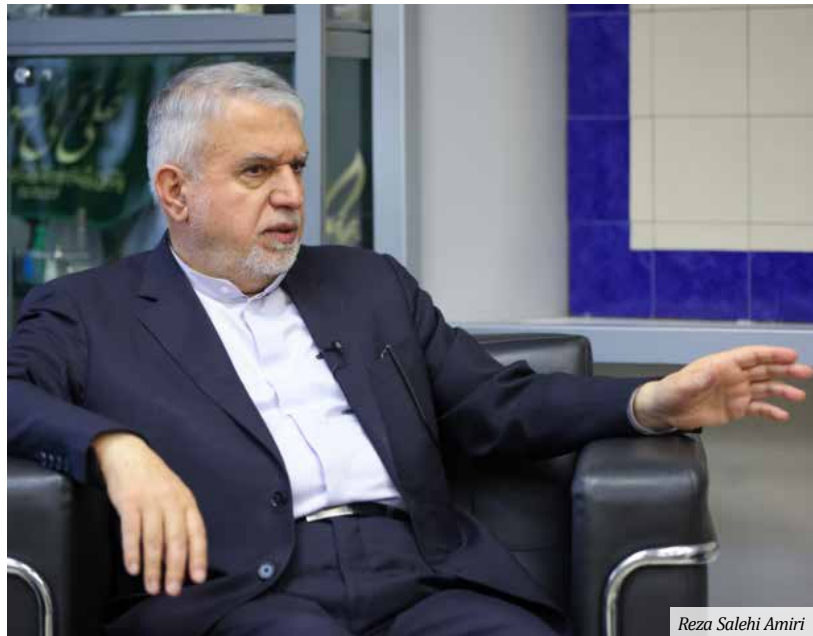
Reza Salehi Amiri