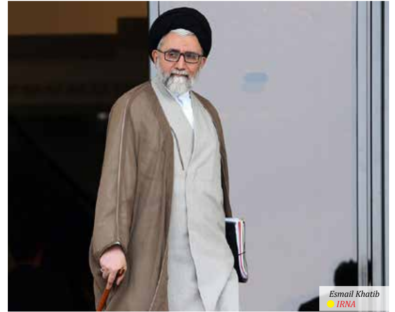
Esmail Khatib

Last year, tensions between the two foes reached an all-time high as they exchanged direct fire amid Israel's ongoing war in Gaza.