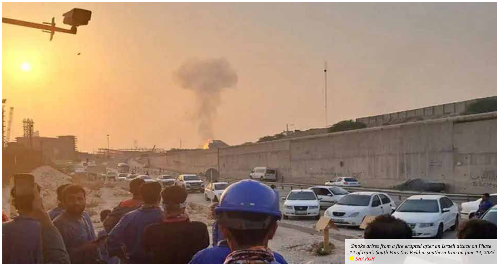
Smoke arises from a fire erupted after an Israeli attack on Phase 14 of Iran's South Pars Gas Field in southern Iran on June 14, 2025.

Chief of Staff of the Iranian Armed Forces Major General Mohammad Hossein Baqeri, Commander of the Islamic Revolution Guards Corps (IRGC) Major General Hossein Salami, Commander of Iran's Khatam al-Anbia Central Headquarters Major General Gholam Ali Rashid, Commander of the IRGC Aerospace Force Major General Amir Ali Hajizadeh, and at least six Iranian nuclear scientists were martyred in the regime's onslaught in the early hours of Friday.