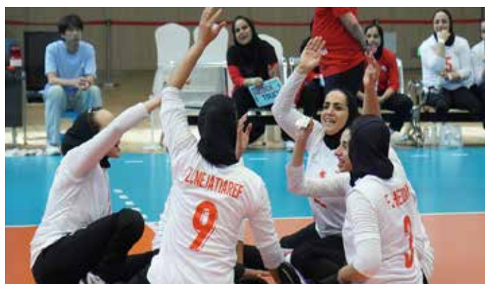
● WORLD PARAVOLLEY

The result was still enough for the Iranian girls to secure a place in October's World Championships in Mersin, Türkiye. Iran began its campaign in Hangzhou with a comfortable 3-0 (25-5, 25-7, 25-6) win against Australia, and then did not concede a single set against Japan (25-8, 25-17, 25-22) and Mongolia (25-4, 25-8, 25-