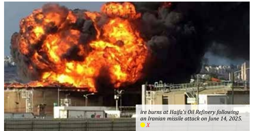
Fire burns at Haifa's Oil Refinery following an Iranian missile attack on June 14, 2025.