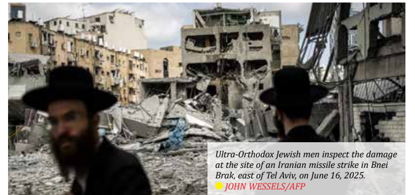
Ultra-Orthodox Jewish men inspect the damage at the site of an Iranian missile strike in Bnei Brak, east of Tel Aviv, on June 16, 2025.

missile attacks on Israel - including Tel Aviv and Haifa - killing at least eight people hours after the Israeli military again bombed the Iranian capital, Tehran. Iran's attacks have claimed the lives of more than 20 Israelis while the death toll from Israel's attacks on Iran has risen to more than 220, including 70 women and children. "A number of our prominent figures and a large number of our compatriots were martyred in this cruel aggression," he added. Meanwhile, Russian President Vladimir Putin and Turkish counterpart Recep Tayyip Erdogan called Monday for an "immediate" end to fighting between Israel and Iran in a phone conversation, the Kremlin said. "The leaders called for an immediate end to hostilities and the settlement of contentious issues, including those related