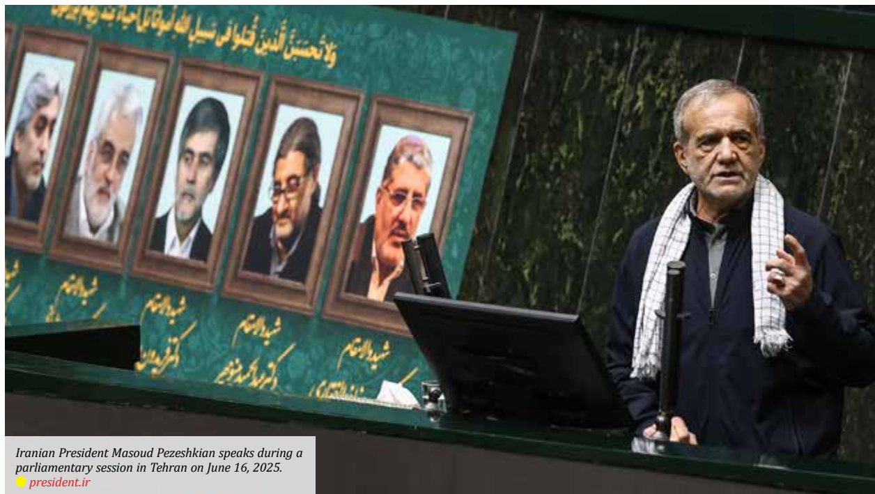
Iranian President Masoud Pezeshkian speaks during a parliamentary session in Tehran on June 16, 2025.