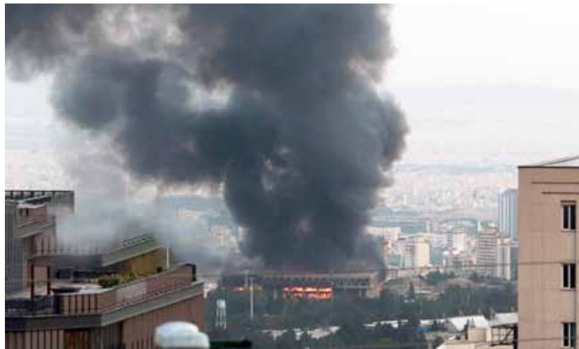
A large fire breaks out at the office of the Islamic Republic of Iran Broadcasting (IRIB) television channel in Tehran, Iran, following an Israeli strike on June 16, 2025.

Iran's Islamic Revolution Guards Corps (IRGC) said in a recent statement that they targeted the intelligence buildings in the central coastal city of Herzliya, including the Mossad and the Israeli military intelligence (Aman). Despite being protected by highly advanced air defense systems, the military intelligence directorate of the Zionist regime's army, known as AMAN, and the Mossad center in Tel Aviv, used for planning assassination attacks and evil acts, were hit by the IRGC, it noted. The IRGC added that fire is now blazing in the doomed center.