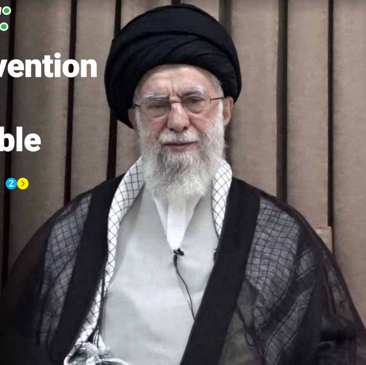
Leader of Iran's Islamic Revolution Ayatollah Seyyed Ali Khamenei addresses the nation in a televised speech on June 18, 2025 in the wake of the ongoing Israeli aggression.

US intervention to cause 'irreparable damage' 2 >