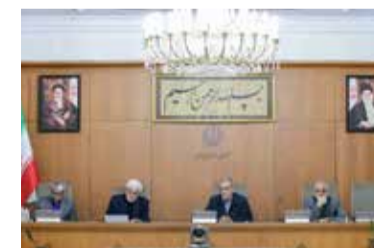
Iranian President Masoud Pezeshkian (3rd L) speaks during the cabinet session held in Tehran on June 18, 2025.

He instructed ministers to delegate authority to local managers and provincial deputies, allowing them to "make immediate decisions when needed" without awaiting central approval.