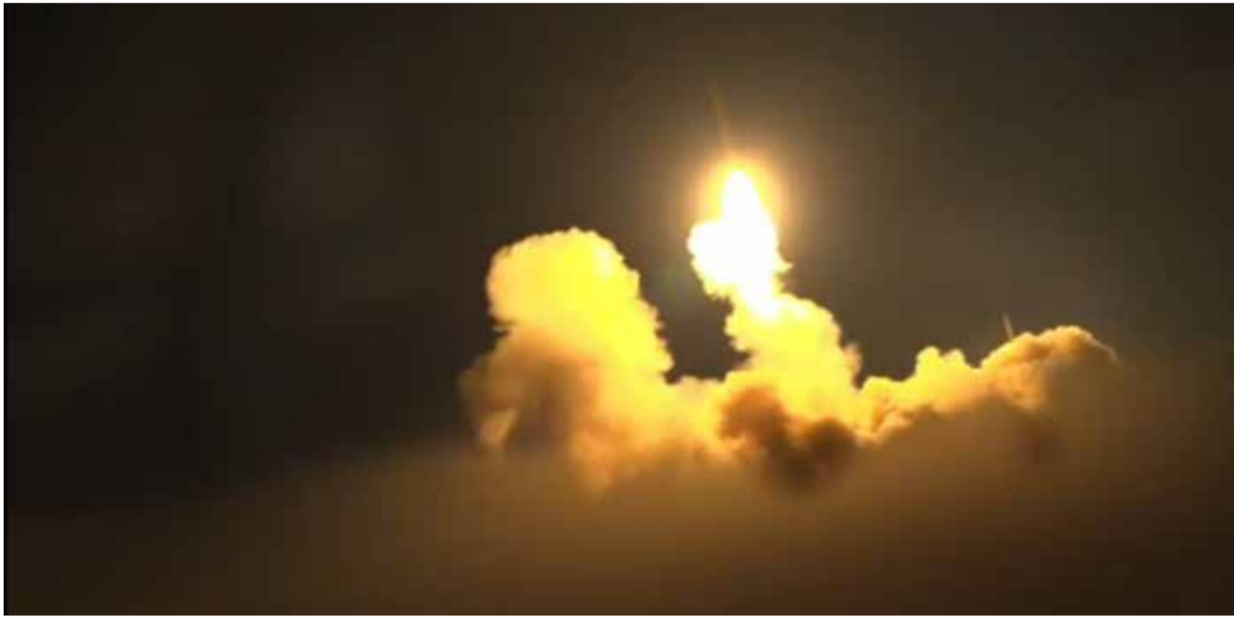
The screengrab was taken from footage released by the Iranian Armed Forces for the first time since the start of the war, showing the launch of missiles from an undisclosed location in Iran toward Israel on June 17, 2025.