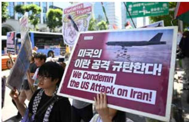
Protesters hold placards condemning the US attacks on Iran during a protest against the ongoing conflict between Israel and Iran, and in solidarity with Palestinians in Gaza, in Seoul on June 22, 2025.

the NPT, the statement added. The Atomic Energy Organisation of Iran (AEOI) also affirmed that the aggression contravenes international law and, regrettably, occurred amid the international nuclear agency’s indifference, or rather, its complicity.