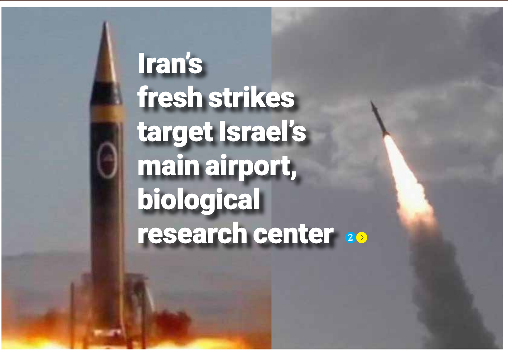
The screen grab from a video released by the Iranian media on June 22, 2025, shows Kheibar hypersonic ballistic missiles being fired from an undisclosed location in Iran toward Israel for the first time since the Israeli aggression earlier in June. The missile has a range of 2,000km and can carry a 1,500km warhead.