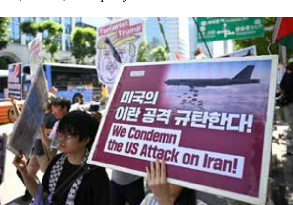
Protesters hold placards condemning the US attacks on Iran during a protest against the ongoing conflict between Israel and Iran, and in solidarity with Palestinians in Gaza, in Seoul on June 22, 2025.

nuclear sites has not led to elevated nuclear radiation beyond the affected facilities. The director of Iran's National Nuclear Safety Centre also confirmed that no radioactive contamination or nuclear radiation has been detected