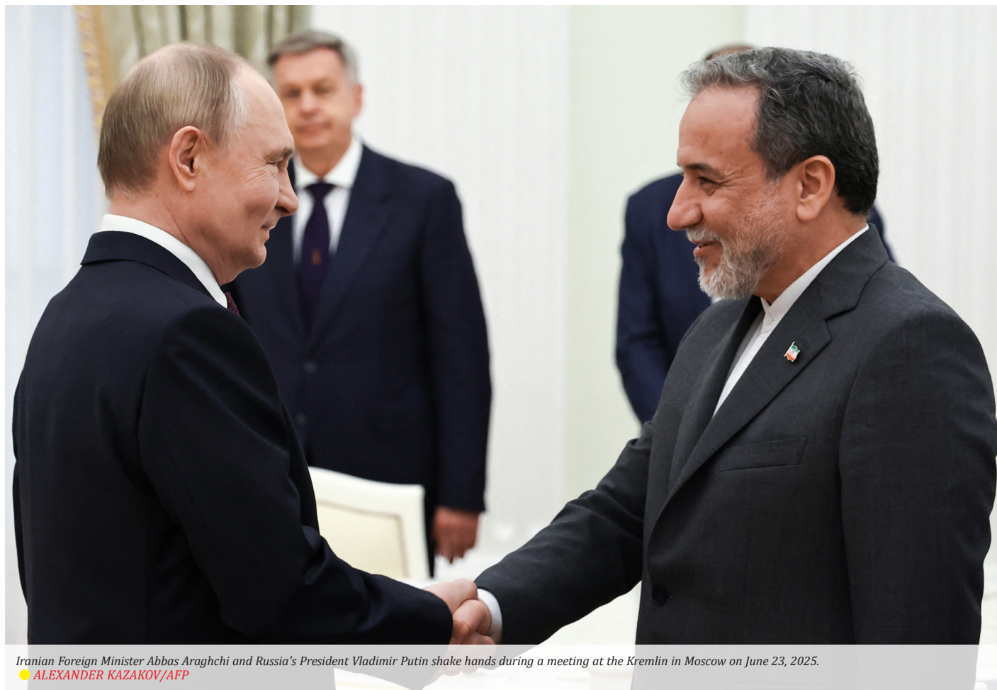
Iranian Foreign Minister Abbas Araghchi and Russia's President Vladimir Putin shake hands during a meeting at the Kremlin in Moscow on June 23, 2025.

Putin also said the Iranian foreign minister's visit to Moscow provided an opportunity to discuss the ways out of the current crisis in the West Asian region.