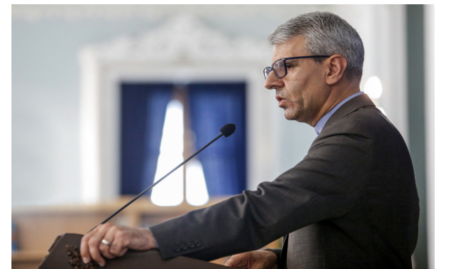
Iran's Foreign Ministry spokesman Esmail Baqaei

Nonetheless, he affirmed that diplomacy will never