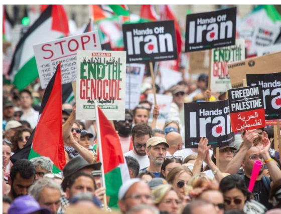
People take to the street in Germany on June 22 2025 to protest the Israeli aggression against Iran.