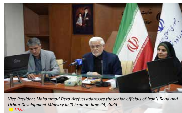
Vice President Mohammad Reza Aref (c) addresses the senior officials of Iran's Road and Urban Development Ministry in Tehran on June 24, 2025.

vices compared to before. "We had already planned in all areas and were prepared accordingly." Aref pointed out that one of the key ministries involved in providing effective services to people was the Ministry of Roads and Urban Development, appreciating the efforts of the minister and the cooperation of the people, drivers, and guild unions. Thanks to these initiatives and teamwork, the ministry and its transportation sector delivered excellent services. Emphasizing the importance of reforms and enhancing cyberse-