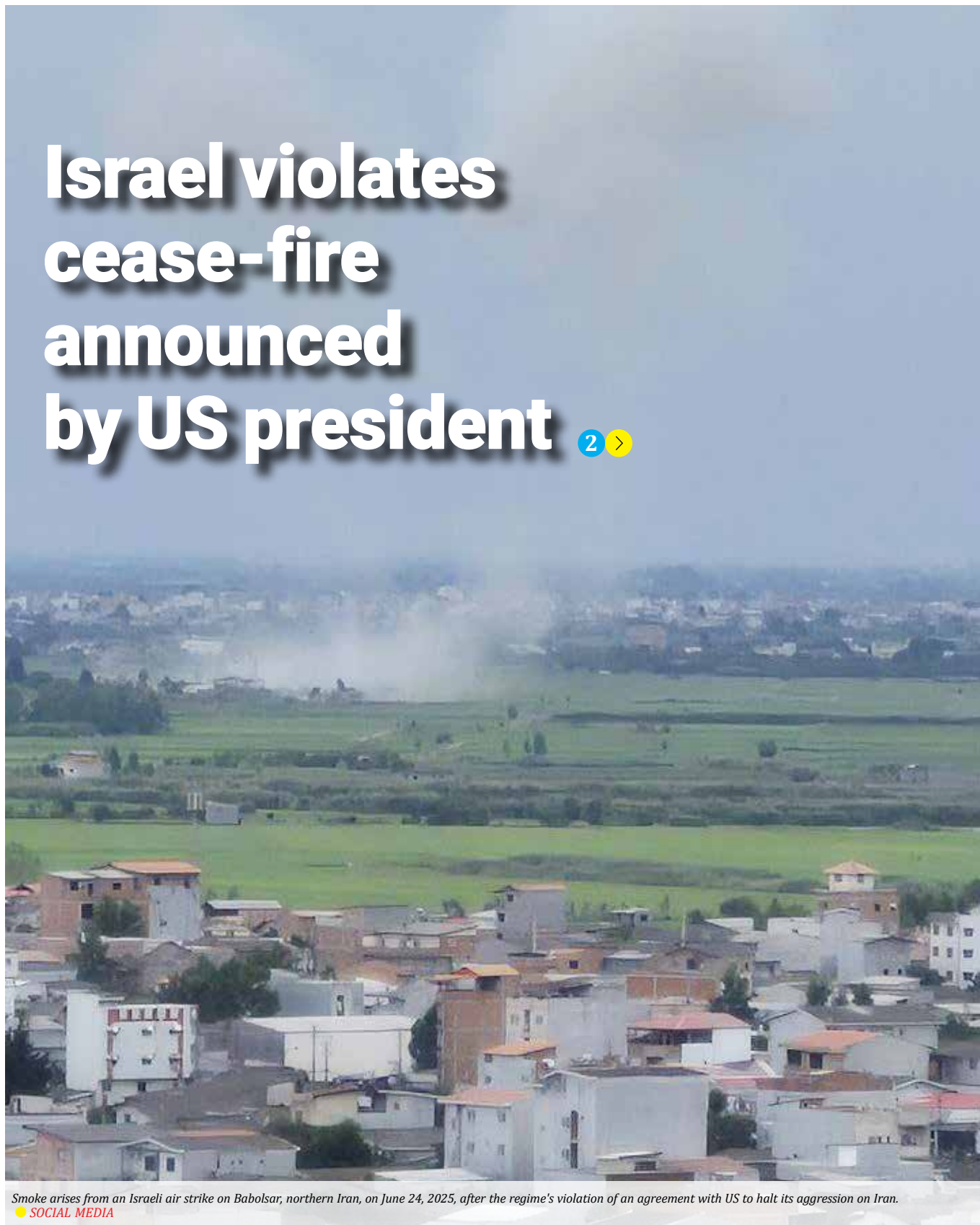
Smoke arises from an Israeli air strike on Babolsar, northern Iran, on June 24, 2025, after the regime's violation of an agreement with US to halt its aggression on Iran.