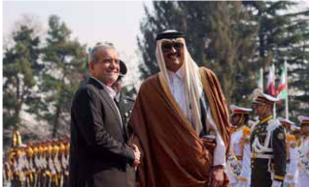
Iranian President Masoud Pezeshkian (L) and Qatari Emir Sheikh Tamim bin Hamad Al Thani shake hands in Tehran, Iran, on February 19, 2025.