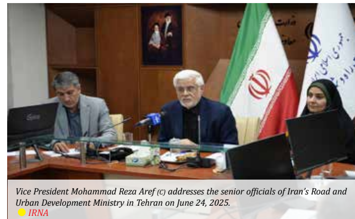
Vice President Mohammad Reza Aref (c) addresses the senior officials of Iran's Road and Urban Development Ministry in Tehran on June 24, 2025.

vices compared to before. "We had already planned in all areas and were prepared accordingly." Aref pointed out that one of the key ministries involved in providing effective services to people was the Ministry of Roads and Urban Development, appreciating the efforts of the minister and the cooperation of the people, drivers, and guild unions. Thanks to these initiatives and teamwork, the ministry and its transportation sector delivered excellent services. Emphasizing the importance of reforms and enhancing cyberse-