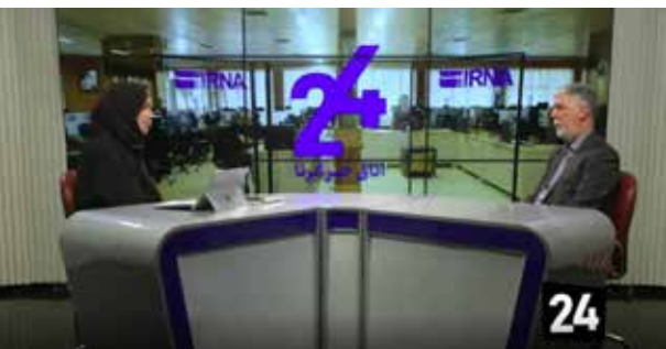
Iran's Minister of Culture and Islamic Guidance, Abbas Salehi speaks at the Islamic Republic News Agency headquarters in Tehran on June 23, 2025.

a similar misjudgment. The army was in disarray, the revolution fresh, and political factions were at each other's throats. He thought Tehran was within reach. He was wrong."