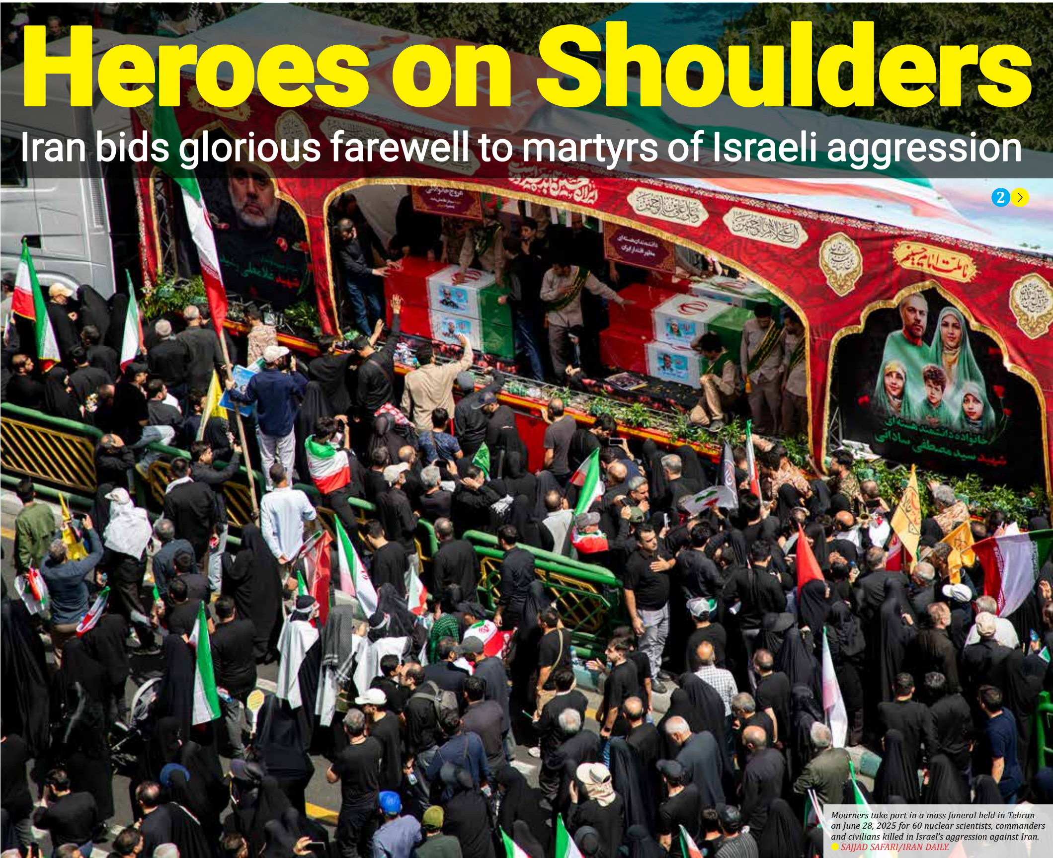
Mourners take part in a mass funeral held in Tehran on June 28, 2025 for 60 nuclear scientists, commanders and civilians killed in Israel's aggression against Iran.

Iran bids glorious farewell to martyrs of Israeli aggression