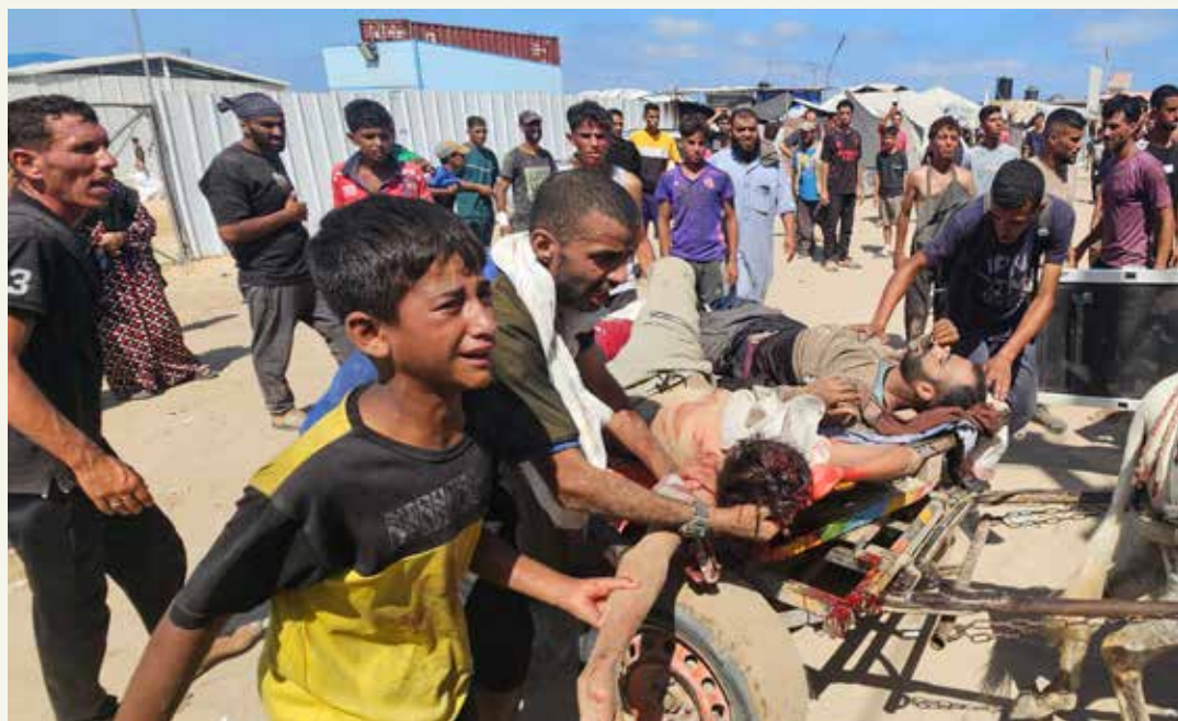
Palestinians transport victims to a Red Cross clinic in Rafah in the southern Gaza Strip after they were shot as they waited to receive food parcels at a distribution point on July 12, 2025.