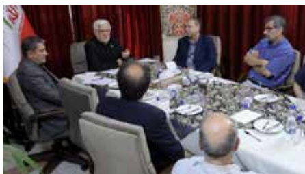
Iran's First Vice President Mohammad Reza Aref (3rd R) meets several professors from Sharif University of Technology in Tehran on July 12, 2025.

He added that a new "Middle East" is emerging, which would be a "resilient and indepen-