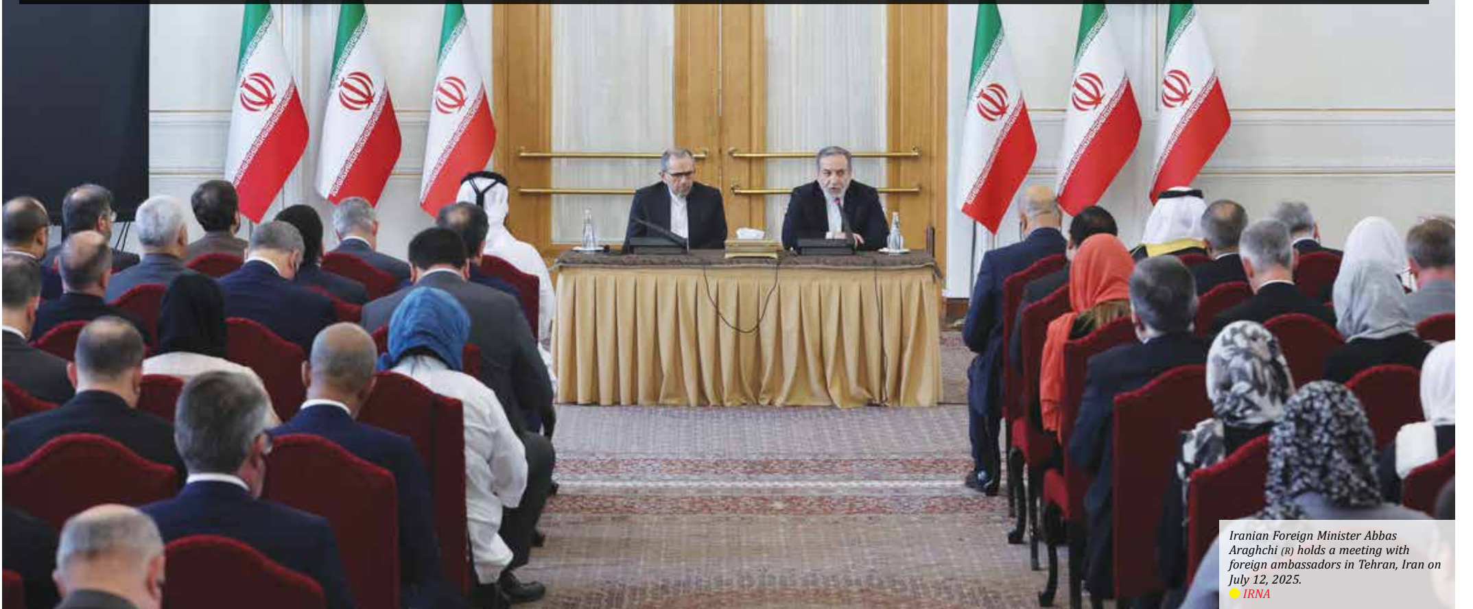
Iranian Foreign Minister Abbas Araghchi (R) holds a meeting with foreign ambassadors in Tehran, Iran on July 12, 2025.