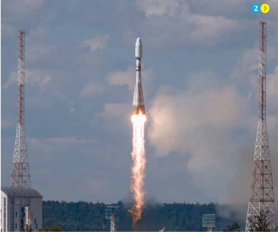
A Soyuz-2.1b rocket booster with a Fregat upper stage, carrying two Ionosfera-M satellites and 18 payloads, including Iran's Nahid-2 telecommunications satellite, blasts off from its launchpad at the Vostochny Cosmodrome in the far-eastern Amur region, Russia July 25, 2025.