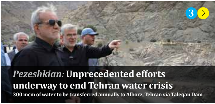
Pezeshkian: Unprecedented efforts underway to end Tehran water crisis 300 mcm of water to be transferred annually to Alborz, Tehran via Taleqan Dam