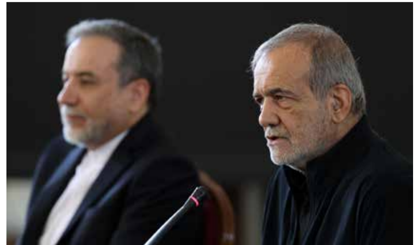
Iranian President Masoud Pezeshkian (R) addresses senior diplomats during a meeting held at the Foreign Ministry building in the capital Tehran on July 26, 2025.

The president referred to the targeting of the Evin Prison by the Israeli regime during its aggression against the