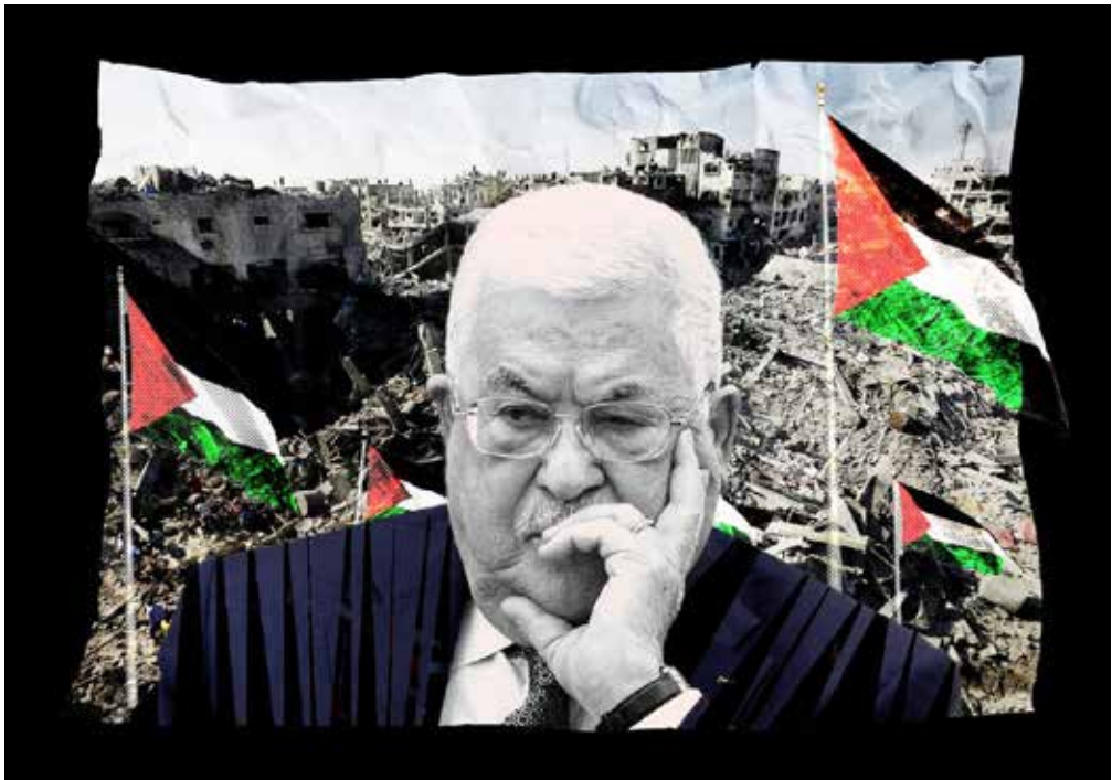
President of the Palestinian Authority (PA) Mahmoud Abbas

This institutional and leadership aging has led to an inability to perform even minimal administrative and functional duties, let alone political and national ones. This includes an inability to pay employee salaries and a reduction of working hours in PA institutions to a minimum. There is general confusion in the performance of national and private sector institutions, bringing the Palestinian administrative and institutional situation to the brink of complete collapse. Perhaps the most dangerous outcome of this leadership state is the profound inability to engage with major and pressing national issues. One rarely sees a serious stance or presence of the political leadership regarding the genocide, destruction, and starvation in the Gaza Strip. The practices of the occupation and settlers in the West Bank confirm the political and field absence of the PA and its various institutions. This performance has likely contributed to the increasing regional and international political marginalization of the Palestinian leadership, even on issues related to the Palestinian cause and its developments. It has become common for the Palestinian file to be discussed in regional and international meetings without Palestinian involvement.