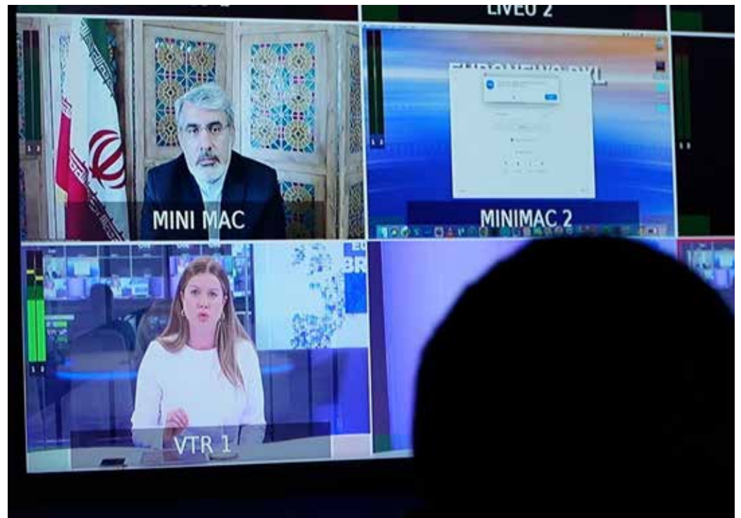
The view from Euronews's newsroom shows Ali Bahraini (upper-L), Iran's ambassador and permanent representative to the United Nations Office and other international organizations in Geneva, answering the TV station's questions on June 19, 2025.