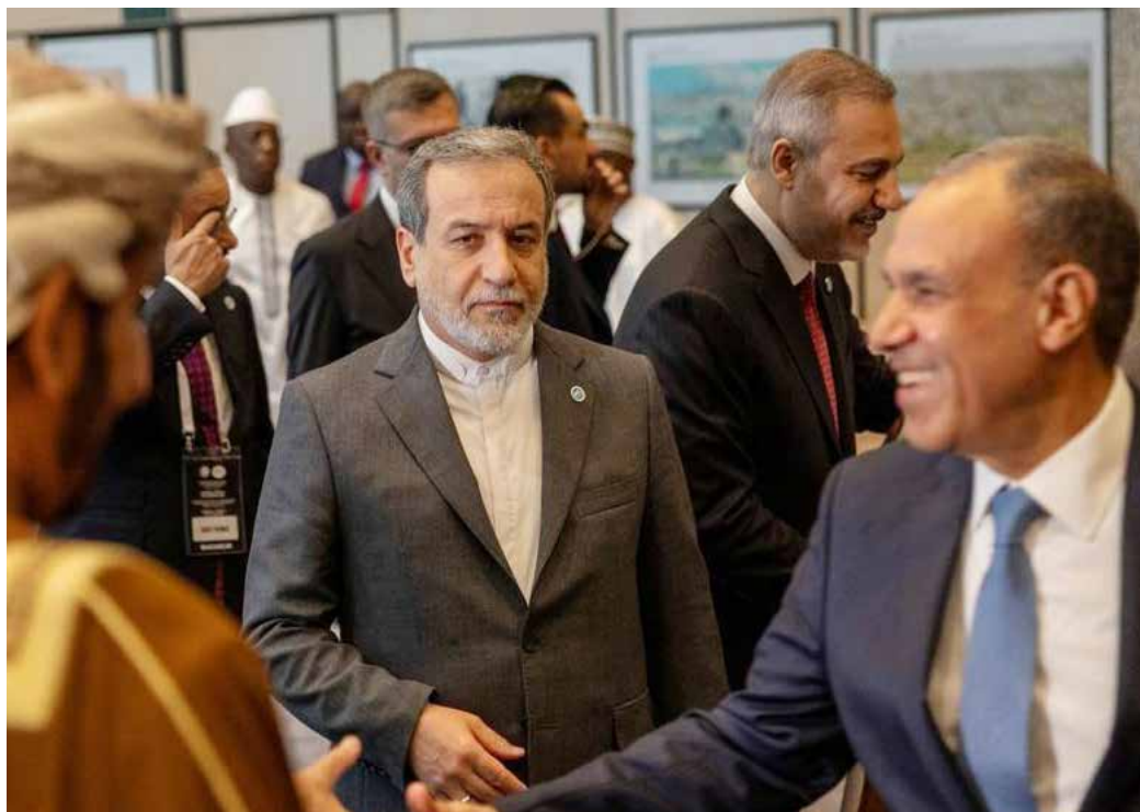
Iranian Foreign Minister Abbas Araghchi (c) takes part in the 51st session of the Council of Foreign Ministers of the Organisation of Islamic Cooperation (OIC) in Istanbul, Turkey, on June 21, 2025, in the midst of the Israeli aggression against Iran.

Let's not forget that in the first two or three days of the war, when it seemed the Zionist regime had the upper hand, a reporter asked Mr. Trump whether he intended to call for a cease-fire to end the clashes, to which he replied it would be very difficult to ask a side on the verge of victory to agree to a cease-fire. But just 72 hours later, after witnessing Iran's destructive missile capabilities — especially after the American Al-Udeid base was hit — Mr. Trump sent out a message asking for a cease-fire.