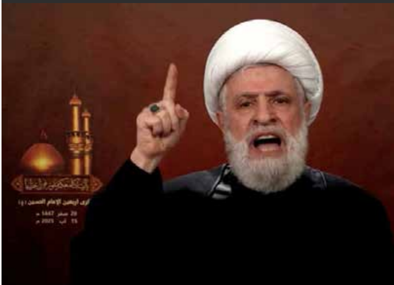
Lebanon's Hezbollah chief Naim Qassem gives a televised speech from an unknown location in this screengrab obtained from video released on August 15, 2025.