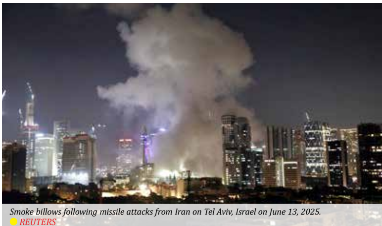
Smoke billows following missile attacks from Iran on Tel Aviv, Israel on June 13, 2025.

"Global arrogant powers have not learned from their successive past failures since the victory of the Islamic Revolution 46 years ago.