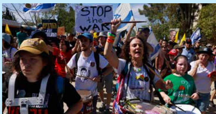
Israelis stage a protest demanding an end to Prime Minister Benjamin Netanyahu's genocidal war on the besieged Gaza Strip in the occupied al-Quds on August 17, 2025.

Demonstrators across the Palestinian occupied territories called for an end to the Gaza war and a deal to release hostages still held in Gaza. The protests come more than a week after Israel's security cabinet approved plans to capture Gaza City, following 22 months of war that have created dire humanitarian conditions in the Palestinian territory, AFP reported.