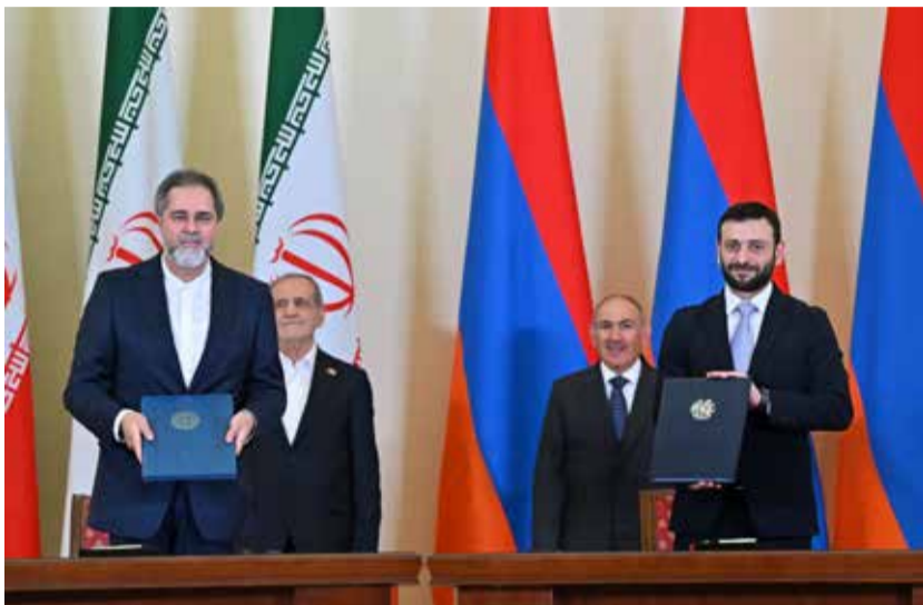
Iran's Farabi Cinema Foundation, making table upgrade in bilateral film industry relations.

ing Iran's regional cinema partnerships. Armenia's film sector, though smaller than Iran's established industry, has shown growing international recognition in recent years. The signing formed part of a broader diplomatic push during Pezeshkian's visit, which saw multiple bilateral agreements inked between the two nations. Armenia's and Iran's foreign ministries also signed a memorandum on political consultations for 2025-2027. Previous cooperation between the countries had been limited to a Statement of Mutual Understanding between Armenia's National Cinema Center and