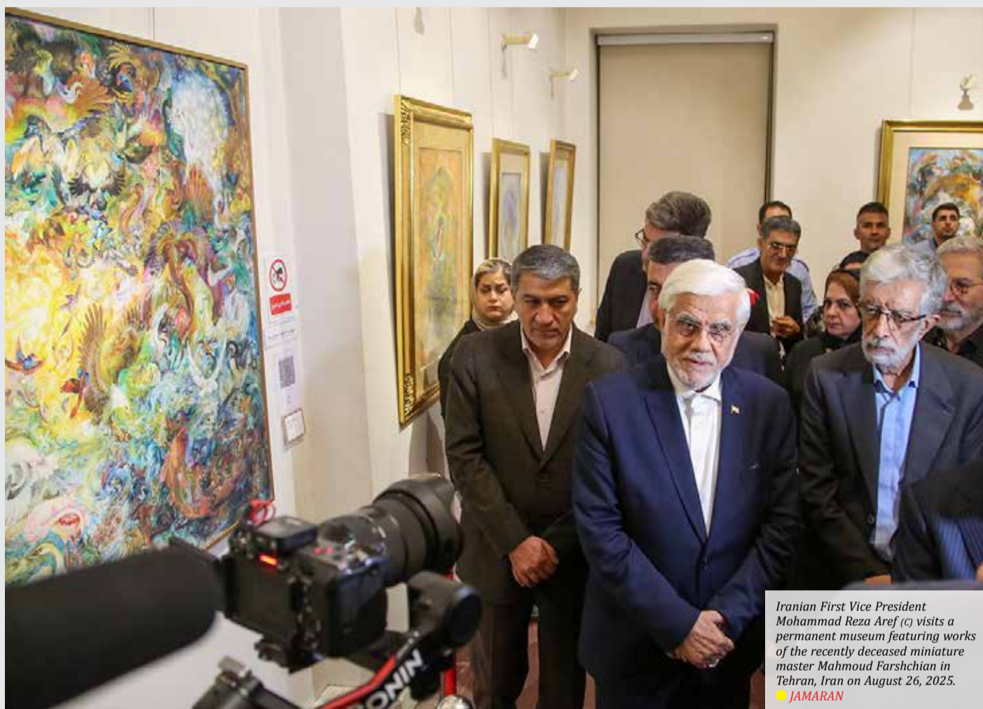
Iranian First Vice President Mohammad Reza Aref (c) visits a permanent museum featuring works of the recently deceased miniature master Mahmoud Farshchian in Tehran, Iran on August 26, 2025.