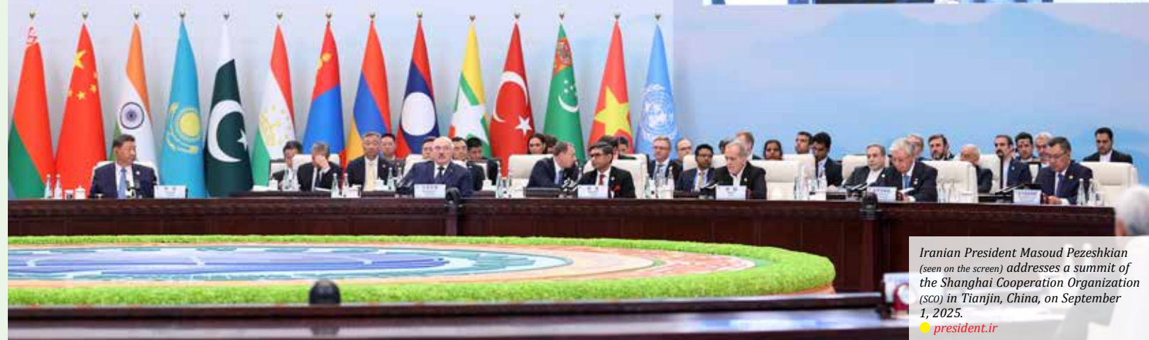
Iranian President Masoud Pezeshkian (seen on the screen) addresses a summit of the Shanghai Cooperation Organization (SCO) in Tianjin, China, on September 1, 2025.