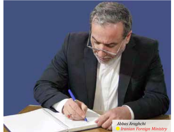
Abbas Araghchi Iranian Foreign Ministry

Stressing that Tehran was open to negotiations on what he termed as a "realistic and lasting bargain," the foreign minister wrote, "Iran remains open to diplomacy. It is ready to forge a realistic and lasting bargain that entails ironclad oversight and curbs on enrichment in exchange for the termination of sanctions." Araghchi said the alternative to diplomacy "may have consequences destructive for the region and beyond on a whole new level," adding that Europe should "give diplomacy the time and space that it needs to succeed." Last week, the European trio triggered the so-called snapback mechanism in Resolution 2231 to restore all UN sanctions against Iran. They gave the Council 30 days to decide whether it would continue sanctions relief against Iran or allow it to lapse.