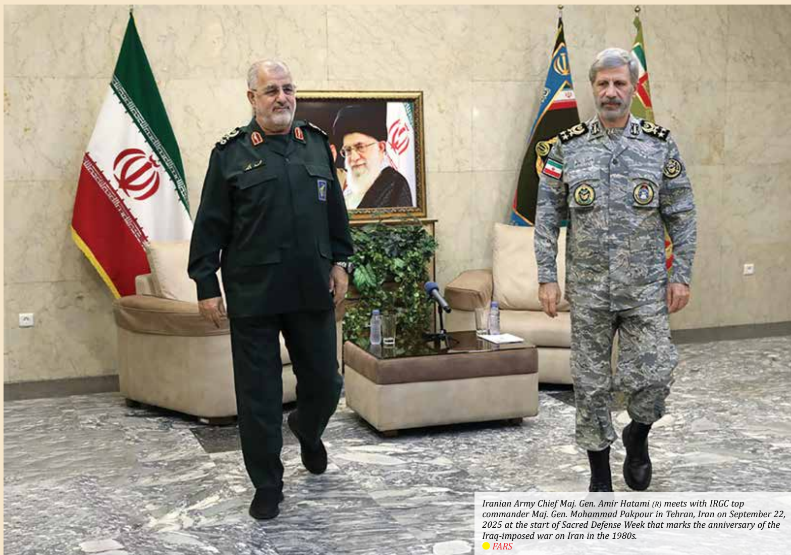
Iranian Army Chief Maj. Gen. Amir Hatami (R) meets with IRGC top commander Maj. Gen. Mohammad Pakpour in Tehran, Iran on September 22, 2025 at the start of Sacred Defense Week that marks the anniversary of the Iraq-imposed war on Iran in the 1980s.