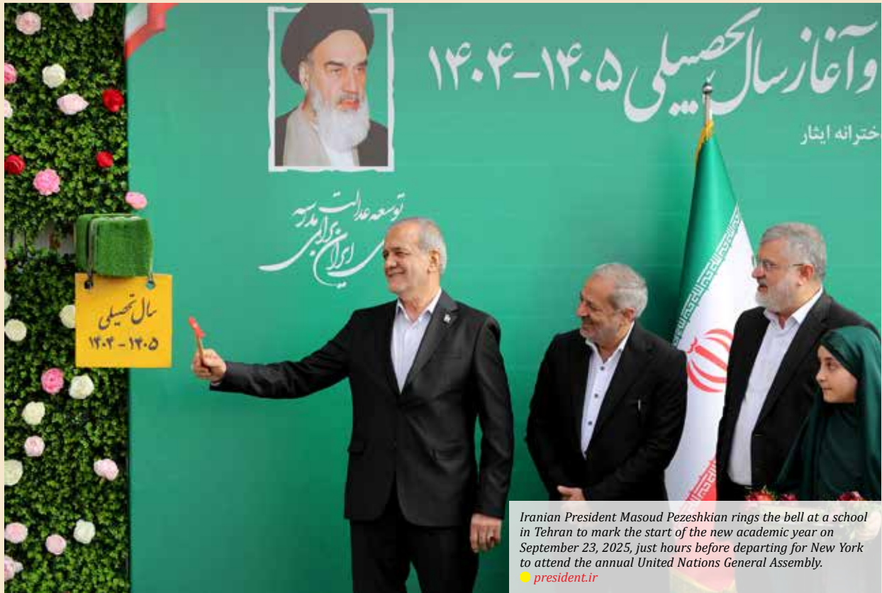
Iranian President Masoud Pezeshkian rings the bell at a school in Tehran to mark the start of the new academic year on September 23, 2025, just hours before departing for New York to attend the annual United Nations General Assembly.