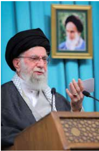
Leader of Iran's Islamic Revolution Ayatollah Seyyed Ali Khamenei addresses the Iranian nation in a live televised speech on September 23, 2025.

stroying the dignity of a nation," he said, warning that the costs would be severe and "some of these harms are irreversible." The Leader said Washington sought dialogue to put an end to Iran's nuclear activities, emphasizing that such a demand by Trump showed a fundamental misunderstanding of the Iranian nation and was "bigger than the speaker's mouth." Ayatollah Khamenei warned that a proud nation like Iran "would slap the speaker of such words in the mouth," and would not accept the idea that enrichment should be halted. The remarks come as US officials press for stricter curbs on Iran's nuclear and missile programs amid threats by the European powers to revive UN sanctions if Iran does not return to talks. "We have not surrendered and will not surrender," Ayatollah Khamenei said, adding that Iran would not bow to pressure to halt uranium enrichment. He said the US expected Tehran to simply "burn down" its nuclear achievements. "They want us to burn down this great achievement that our nation has paid so much for."