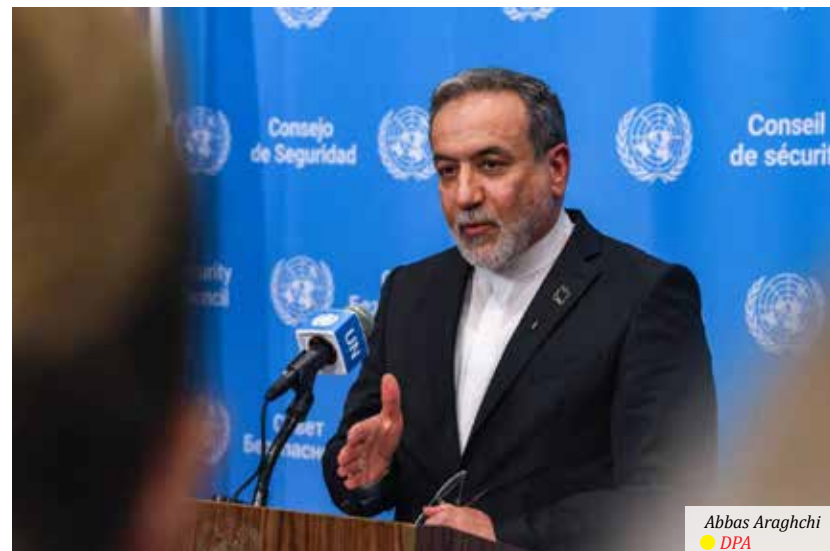
Abbas Araghchi ● DPA

Araghchi said that the US struck the Iranian nuclear sites in June and caused severe damage to them, but the military action failed to resolve the standoff since Iran possesses indige-