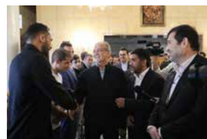
Iranian President Masoud Pezeshkian shakes hands with wrestlers at a ceremony held in Tehran on September 30, 2025 to honor the national freestyle and Greco-Roman wrestling teams for their recent world championship victories.

"They want to force us to submit to base and vile people, but even imagining that has no place in my mind," Pezeshkian