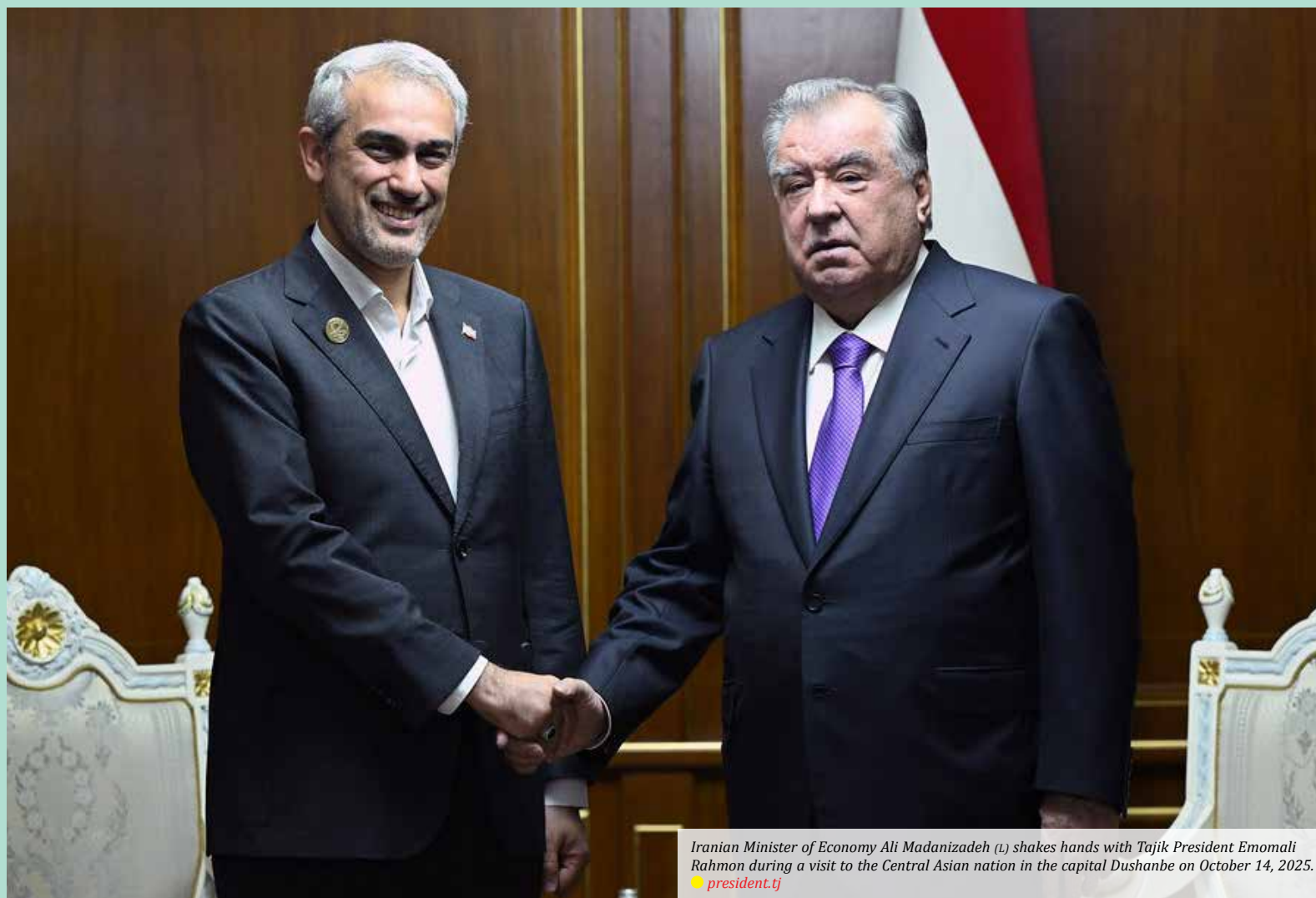
Iranian Minister of Economy Ali Madanizadeh (L) shakes hands with Tajik President Emomali Rahmon during a visit to the Central Asian nation in the capital Dushanbe on October 14, 2025.

Iran should not fall for Trump's words without seeing real action