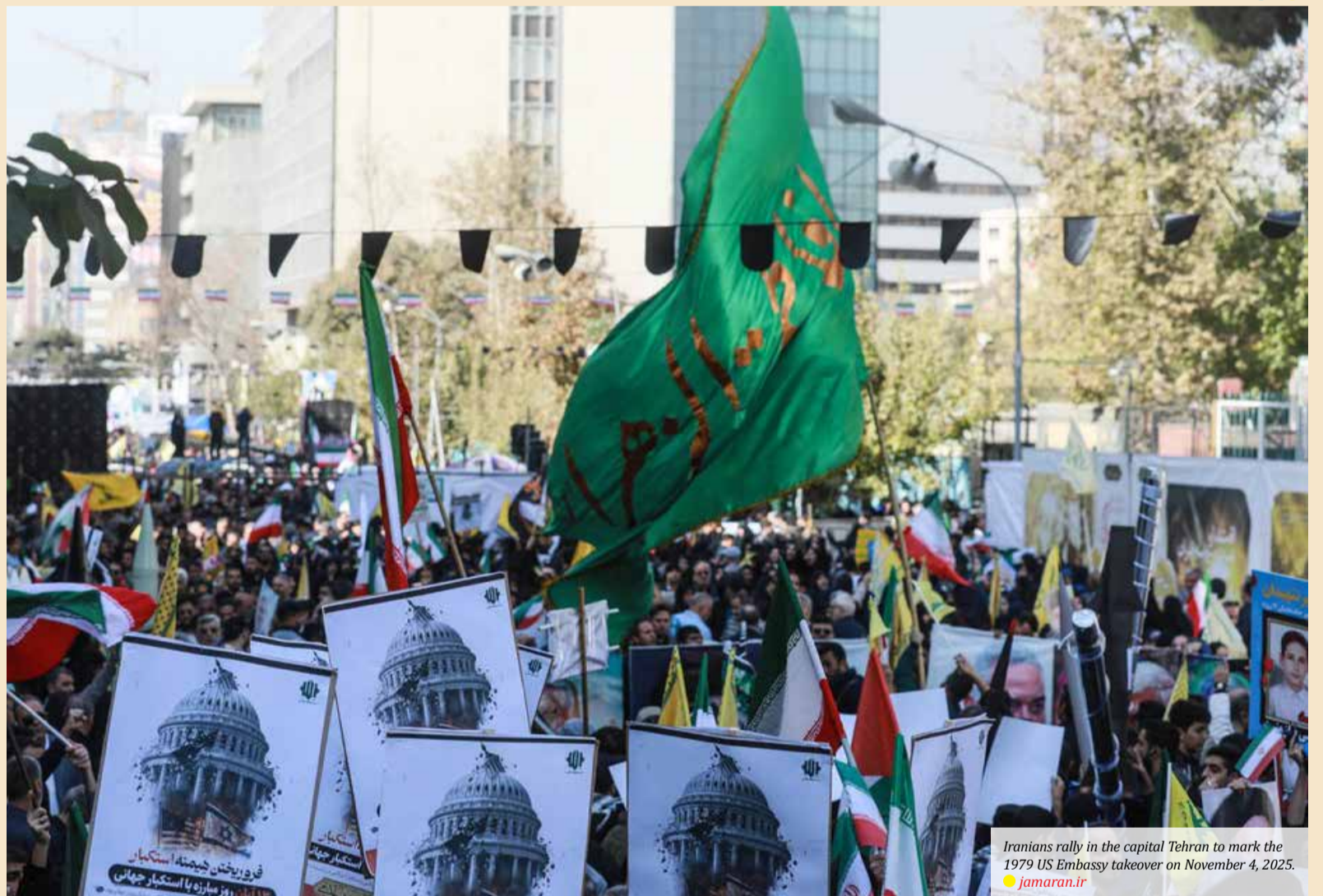
Iranians rally in the capital Tehran to mark the 1979 US Embassy takeover on November 4, 2025.