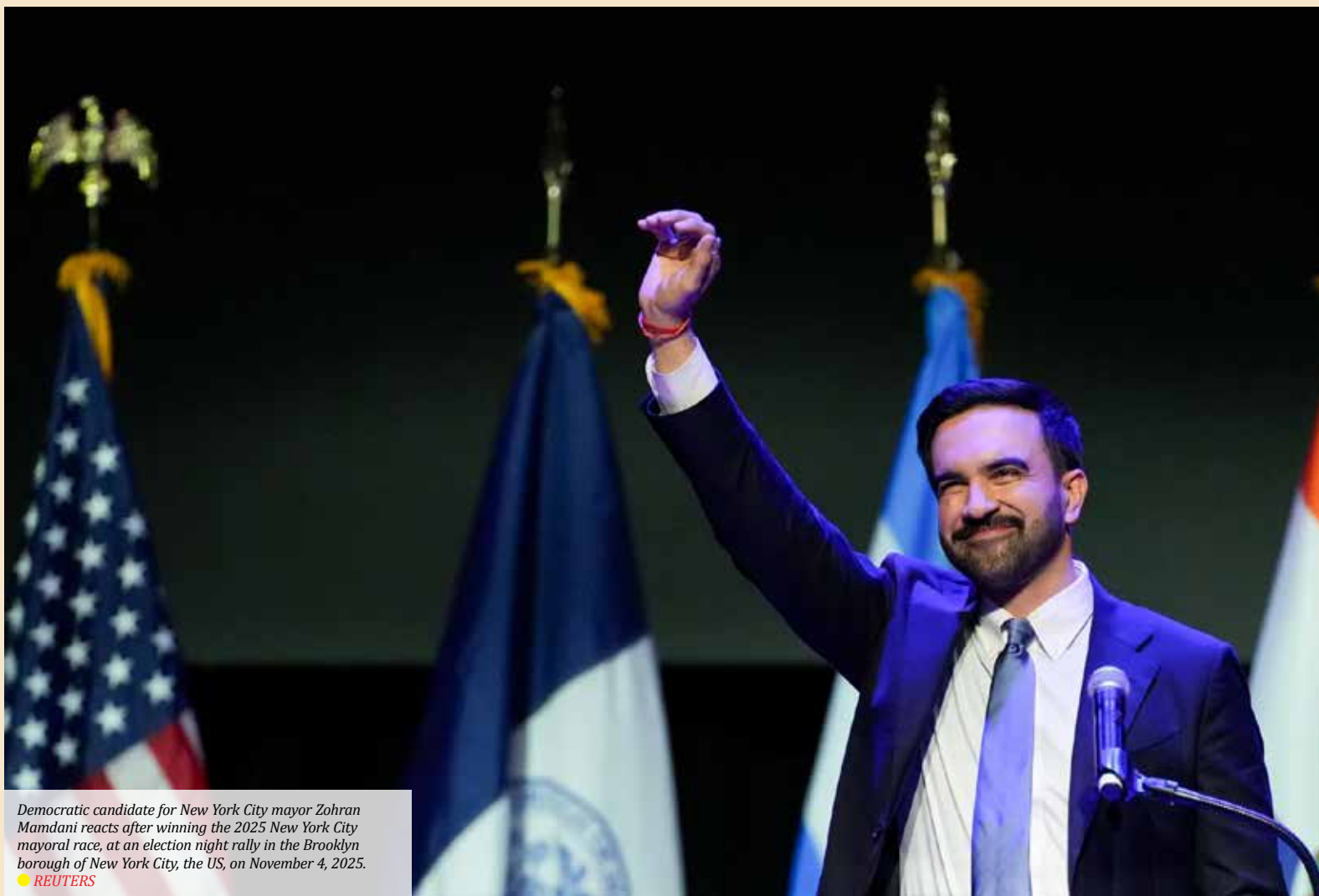
Democratic candidate for New York City mayor Zohran Mamdani reacts after winning the 2025 New York City mayoral race, at an election night rally in the Brooklyn borough of New York City, the US, on November 4, 2025.