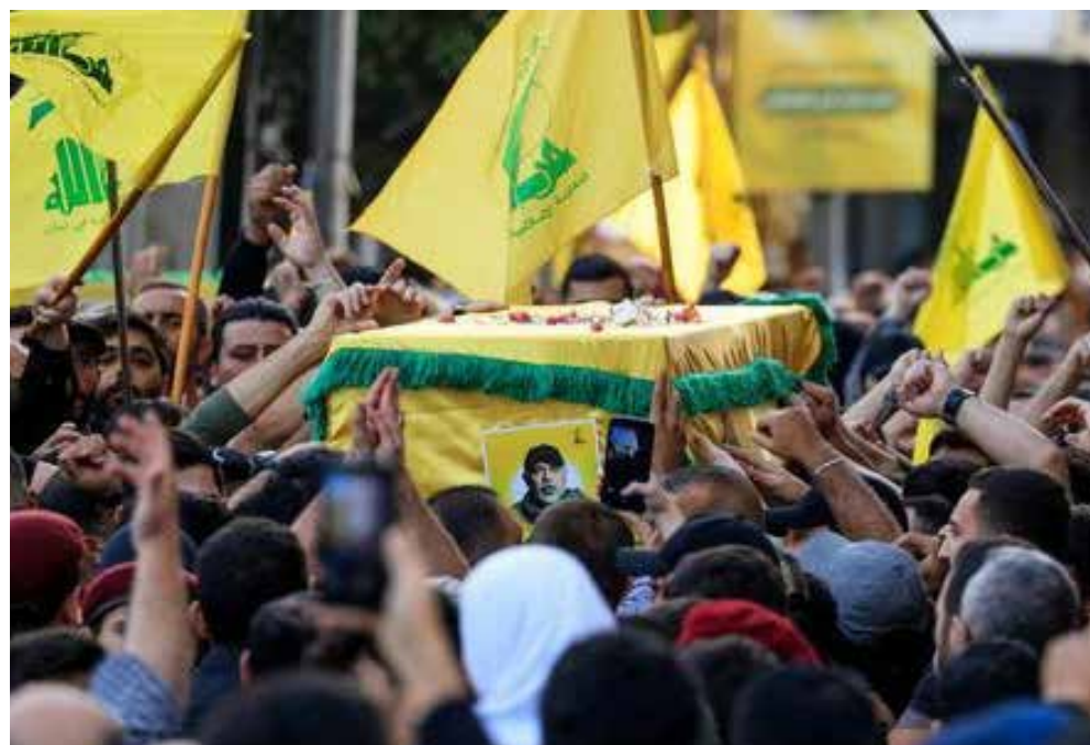
Mourners carry the coffin of Hezbollah military chief Haytham Ali Tabatabai during a funeral in the southern suburbs of Beirut, Lebanon on November 24, 2025.

According to Lebanese authorities, Israeli attacks have killed approximately 4,000 people and displaced more than 1.2 million residents across the country since October 2023.