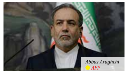
Abbas Araghchi

The ceasefire was reached after more than a year of attacks against the backdrop of the Gaza war. Over 4,000 people were killed, and 17,000 others were injured in the attacks. Under the ceasefire, the Israeli army was supposed to withdraw from southern