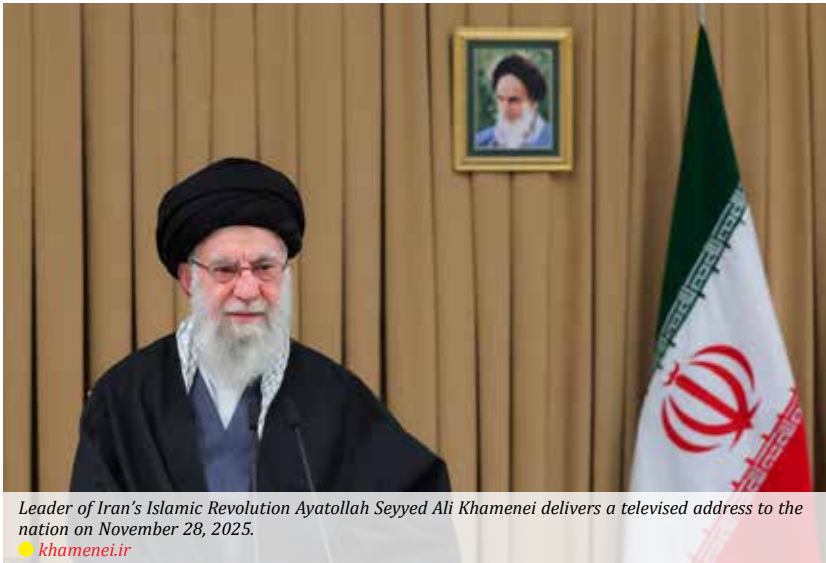
Leader of Iran's Islamic Revolution Ayatollah Seyyed Ali Khamenei delivers a televised address to the nation on November 28, 2025.

Washington 'suffered losses, failed to achieve any goals' in 12-day war