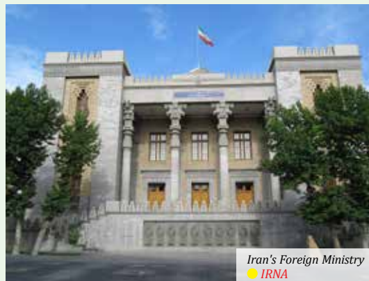
Iran's Foreign Ministry ● IRNA

The ministry was referring to Australia's expulsion of the Iranian ambassador