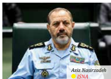
Aziz Nasirzadeh ● ISNA

"Threats are tracked meticulously and without pause," he stated, adding that the core priority was not merely surveillance, but the sustained combat readiness of the country's defense forces.