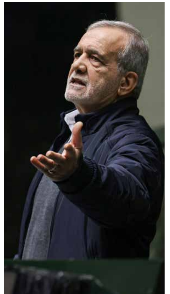
President Masoud Pezeshkian addresses the Iranian Parliament to defend a government-proposed budget bill for the next fiscal year in Tehran, Iran on December 28, 2025.