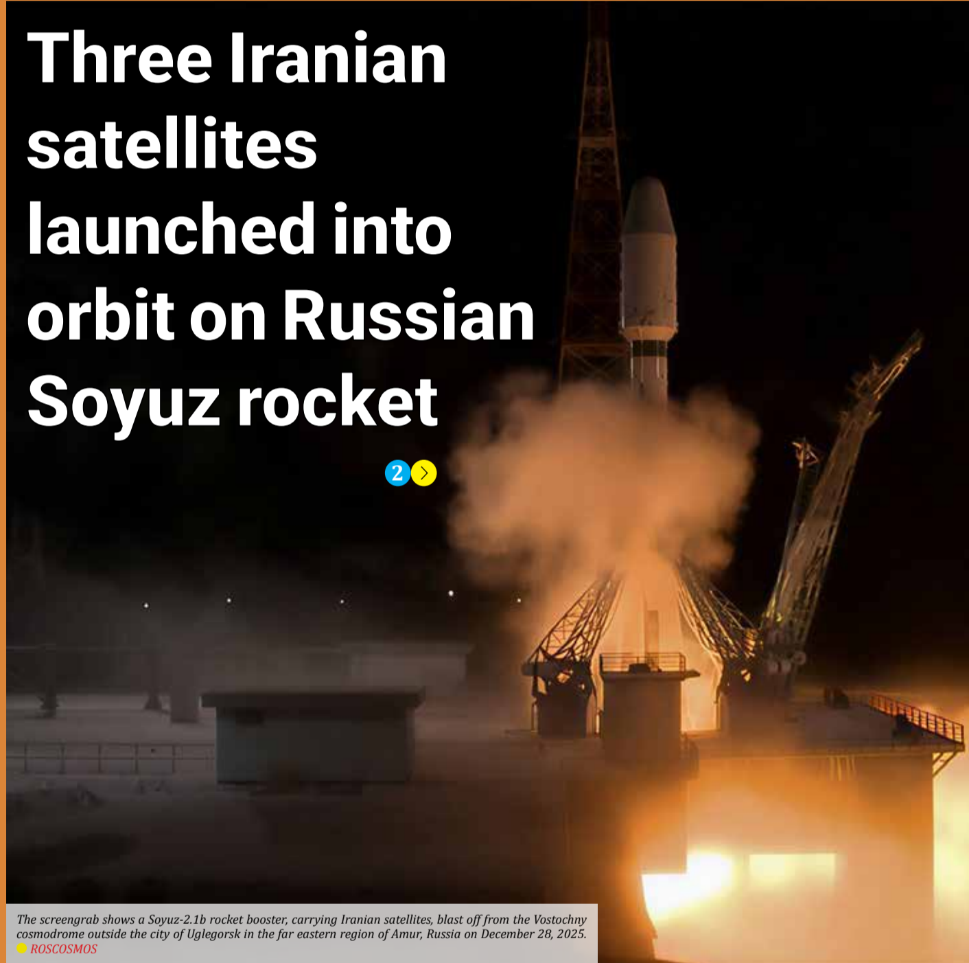
The screengrab shows a Soyuz-2.1b rocket booster, carrying Iranian satellites, blast off from the Vostochny cosmodrome outside the city of Ulgorsk in the far eastern region of Amur, Russia on December 28, 2025.