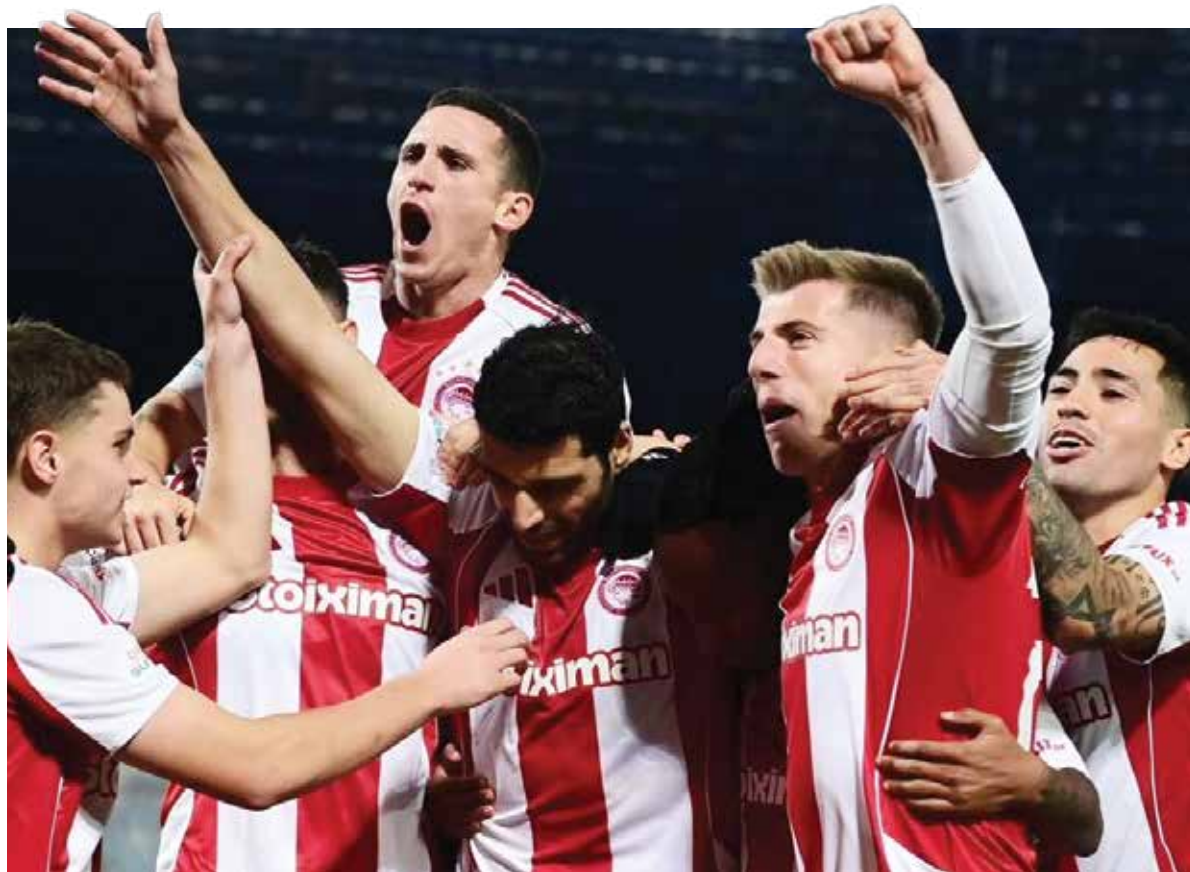
Iranian striker Mahdi Taremi (C) is surrounded by his Olympiacos teammates after scoring in a 3-0 victory over OFI in the Greek Super Cup game at the Pankritio Stadium, Heraklion, Greece, on January 3, 2025.