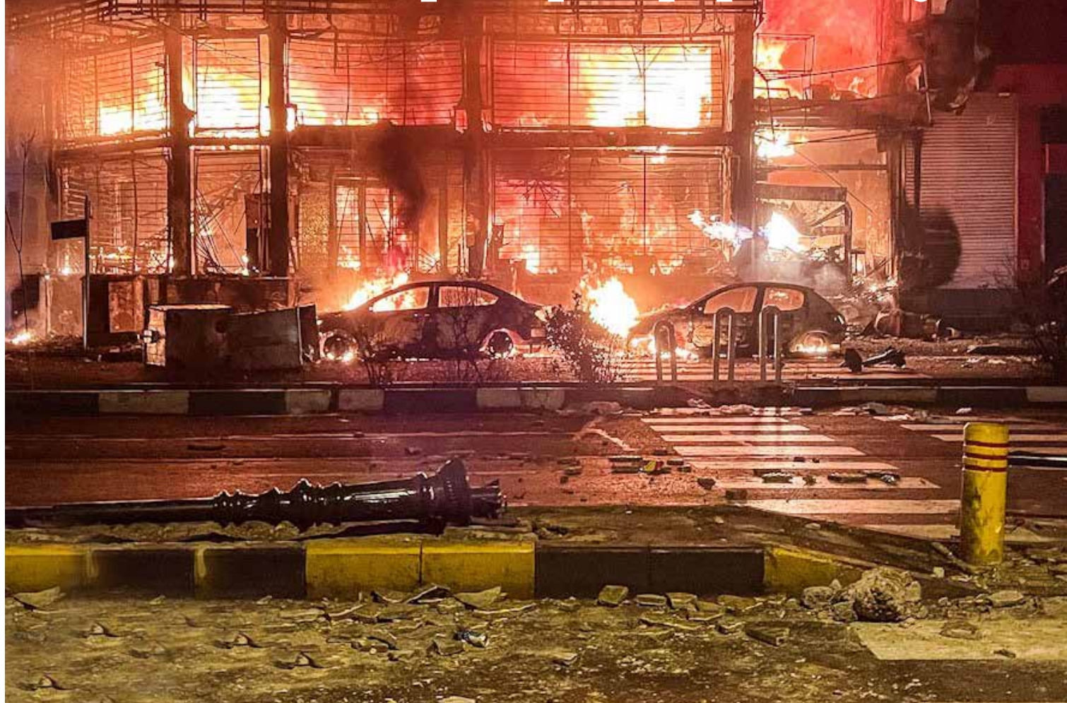
A building and cars parked in front of it are set ablaze in an undisclosed location in Tehran, Iran, on January 9, 2026.

Armed forces united to protect public properties: Army