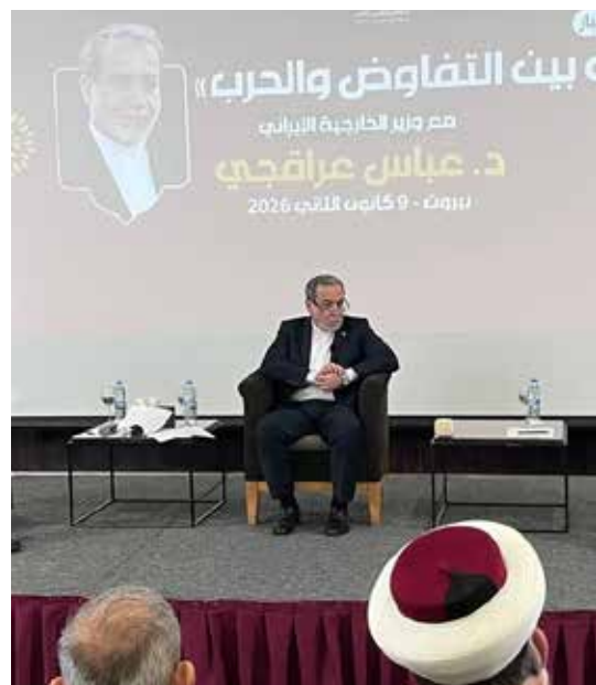
Iranian Foreign Minister Abbas Araghchi speaks at a ceremony to unveil his book titled 'Power of Negotiation' in Arabic in Beirut, Lebanon, on January 9, 2026.