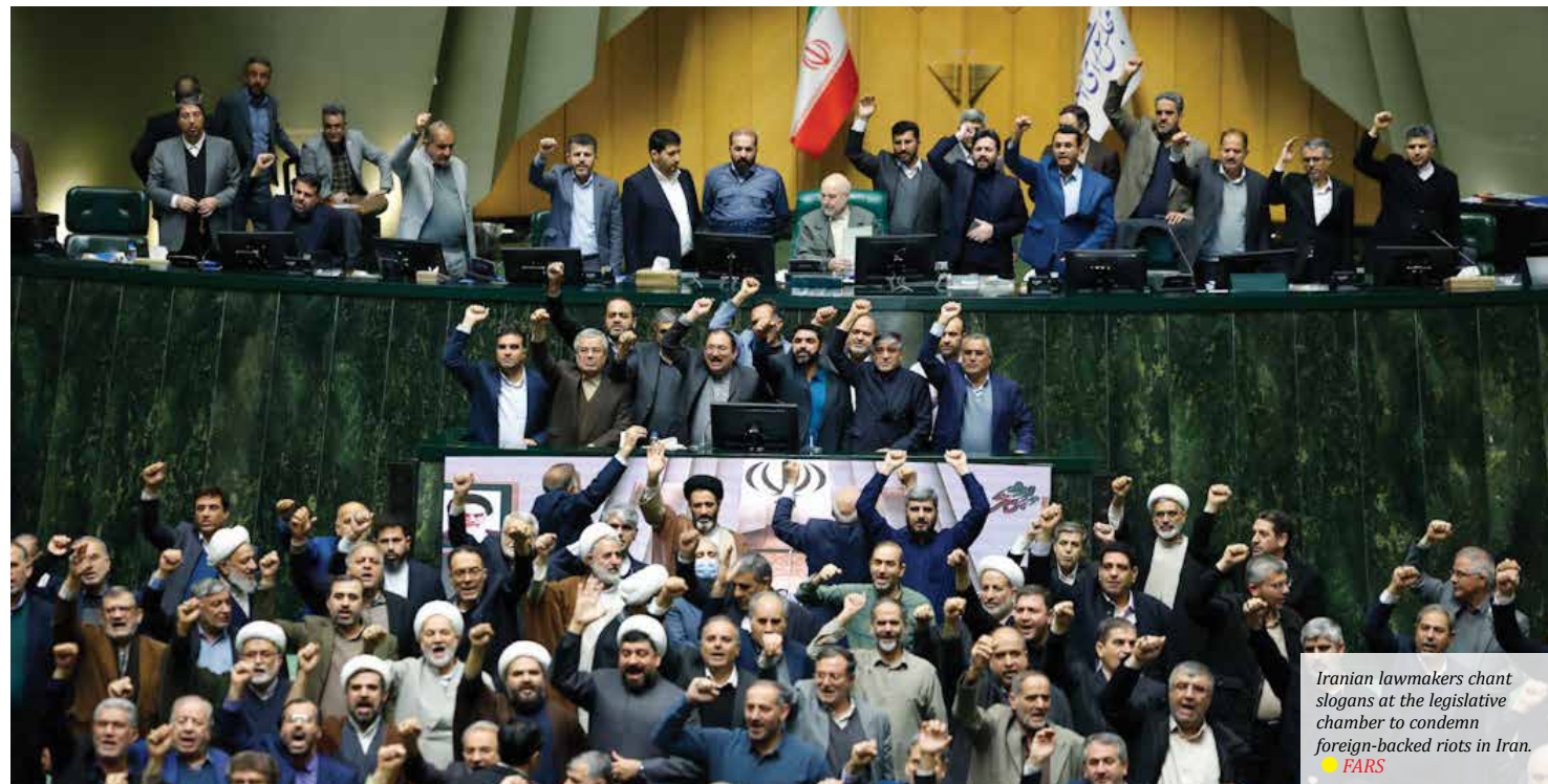
Iranian lawmakers chant slogans at the legislative chamber to condemn foreign-backed riots in Iran.