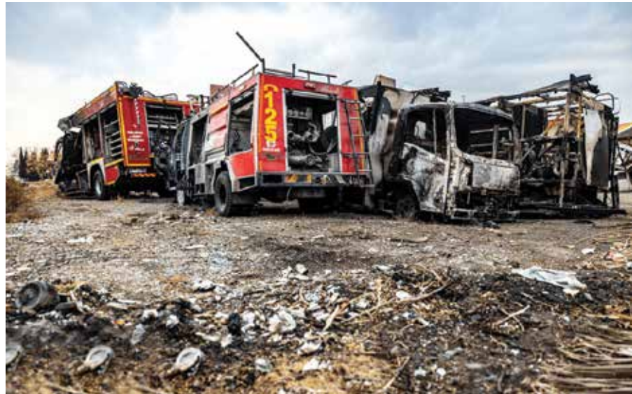
The photo shows a number of fire trucks that were burned and became unusable by rioters in Tehran, on January 10, 2026.

"In recent protests, we saw a few opportunists turning