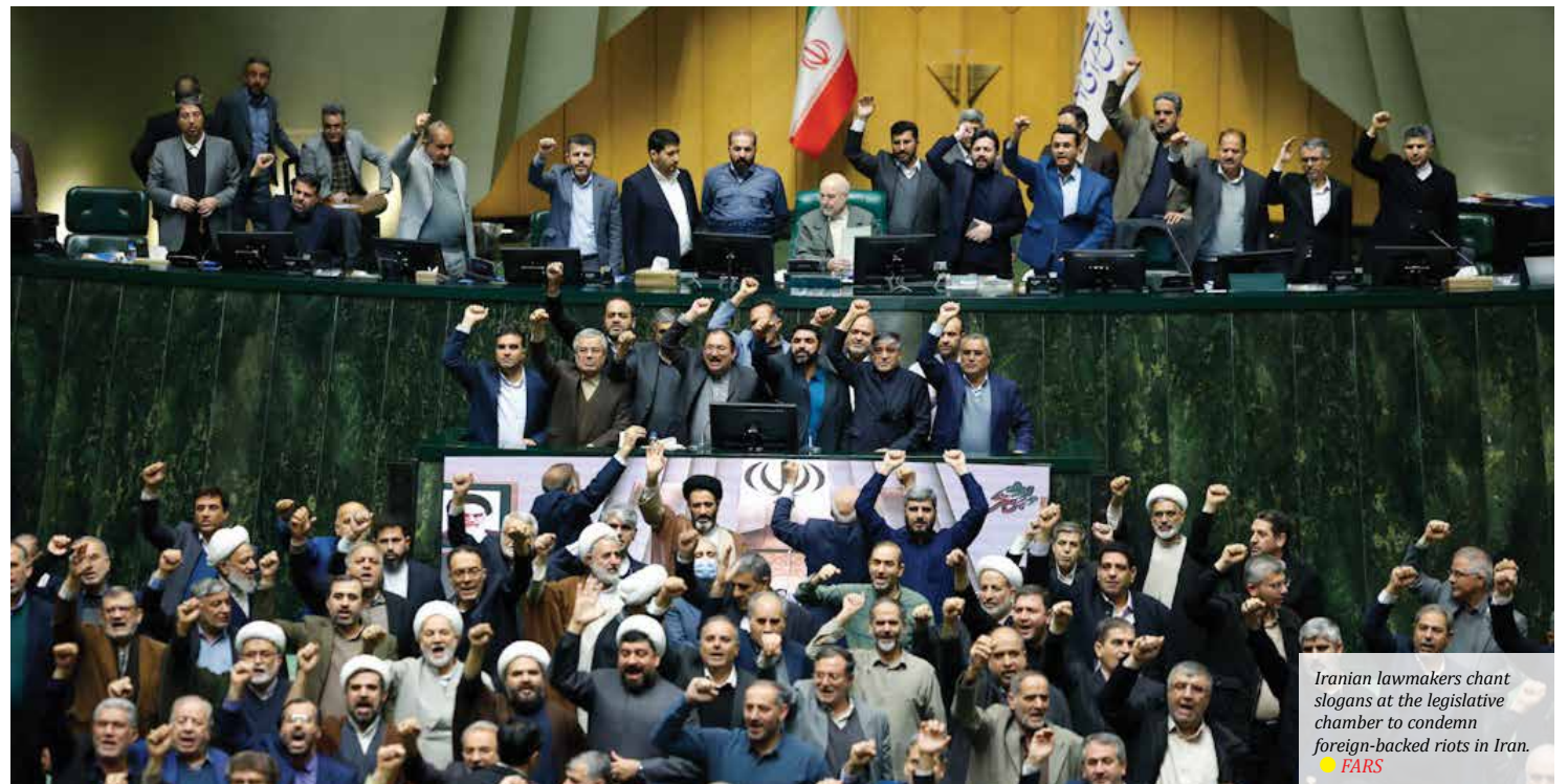
Iranian lawmakers chant slogans at the legislative chamber to condemn foreign-backed riots in Iran.