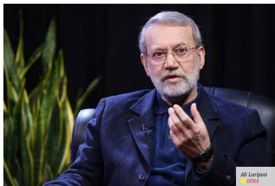
Ali Larijani

it clear that the Islamic Republic, which has come into being with the sacrifices made by hundreds of thousands of noble people, will