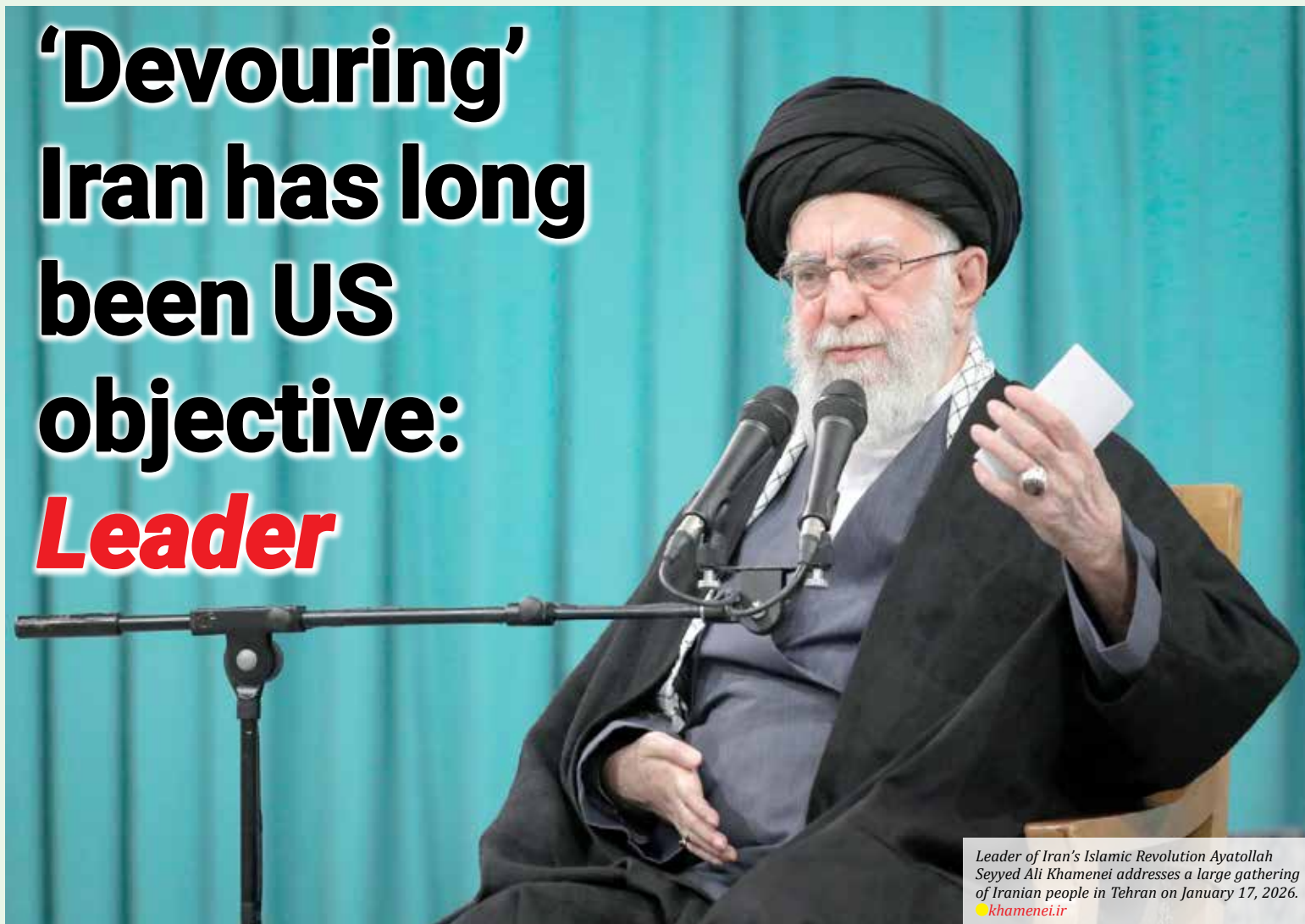
Leader of Iran's Islamic Revolution Ayatollah Seyyed Ali Khamenei addresses a large gathering of Iranian people in Tehran on January 17, 2026.