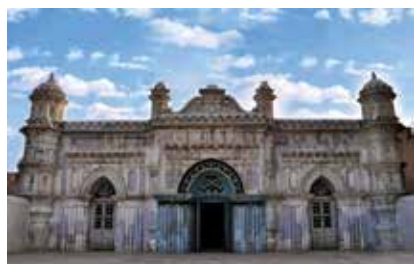
Rangooniha Mosque; unique structure with extraordinary architecture