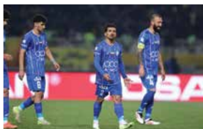
Iranian clubs to host Asian games in neutral venues