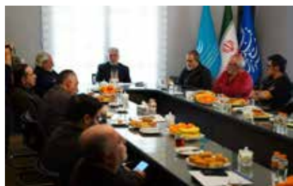
Minister hails Fajr Film Festival as symbol of national identity