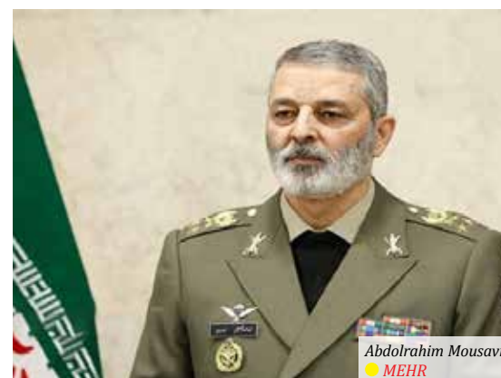
Abdolrahim Mousavi

Chief of Staff of the Iranian Armed Forces Major General Abdolrahim Mousavi said on Saturday that Iran's enemies have distorted reality of recent developments in the country by using the mainstream media and "cognitive war." "Over the course of a soft war, the enemy influenced a number of people in the society through its propaganda empire and cognitive war, turning the reality upside down," Mousavi said at a meeting with Iran's cultural officials. The top general called on the officials and the relevant cultural authorities to transfer the Islamic Revolution and the Sacred Defense ideals to the younger generations as a way to tackle the "enemy's tricks in the cultural area." He also called for revealing the enemy's crimes against the Iranian nation. Since the beginning of recent protests in Iran over eco-