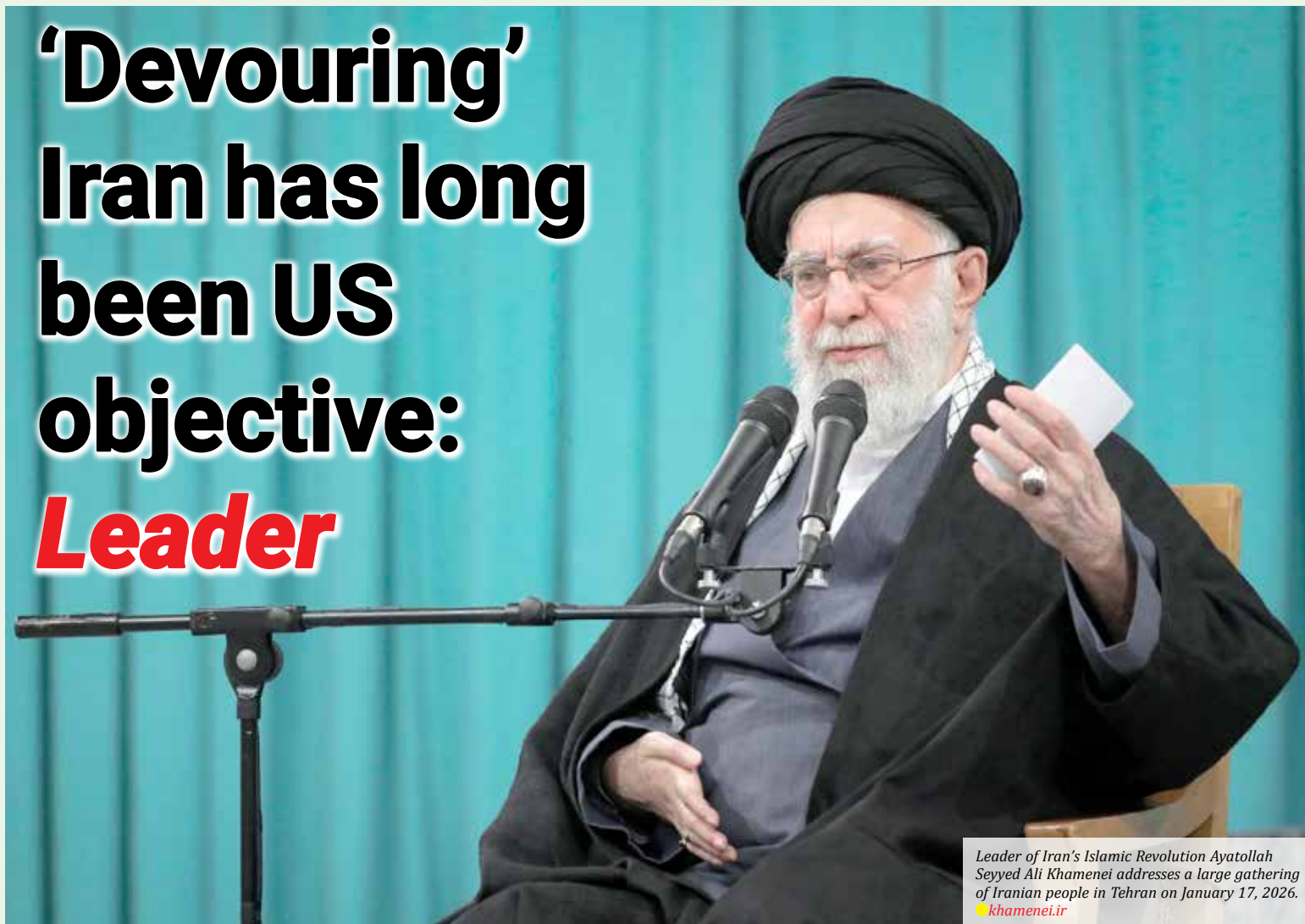
Leader of Iran's Islamic Revolution Ayatollah Seyyed Ali Khamenei addresses a large gathering of Iranian people in Tehran on January 17, 2026.