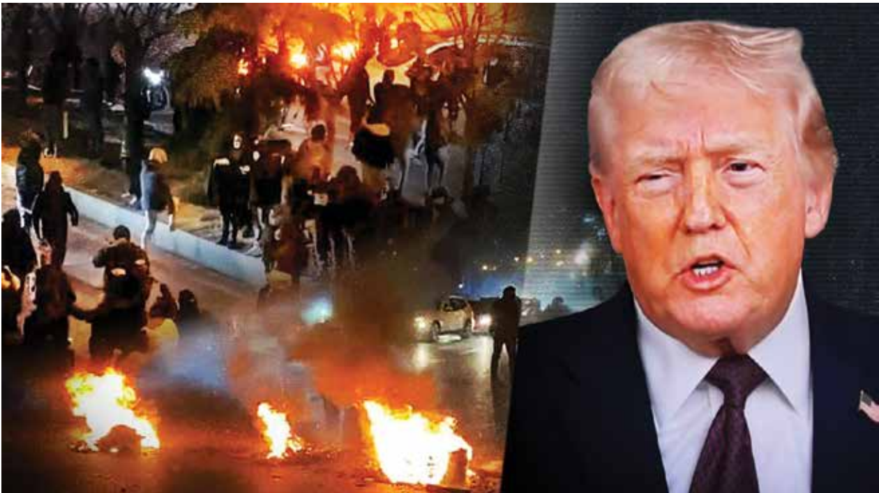
The photo shows the US President Donald Trump to the right and violent riots in Iran to the left. ● NHK WORLD

of the Zionist regime and not permit the stability and security of the West Asian region and Muslim nations to be imperiled by the spurious regime. Iran safeguards the legitimate political, economic, and cultural rights of its citizens and recognizes the fundamental rights of its nationals to civil and social participation within the framework of the constitution. Iran shall provide for the rightful demands of the people and considers itself obligated to observe human rights protocols, but does not permit foreign intervention in its internal affairs. Iran is committed to di-