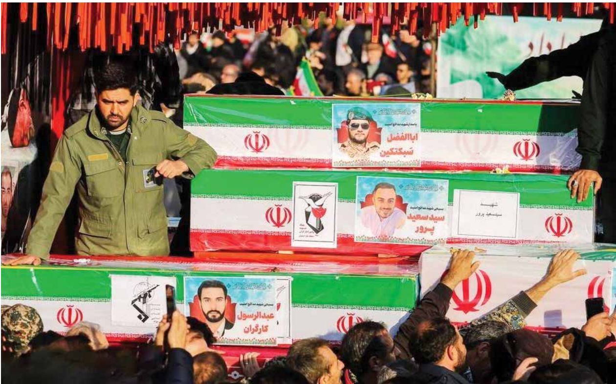
Iranians bid farewell to security forces who were martyred during the recent violent riots, on January 12, 2026.

The article first appeared in Persian on IRNA.