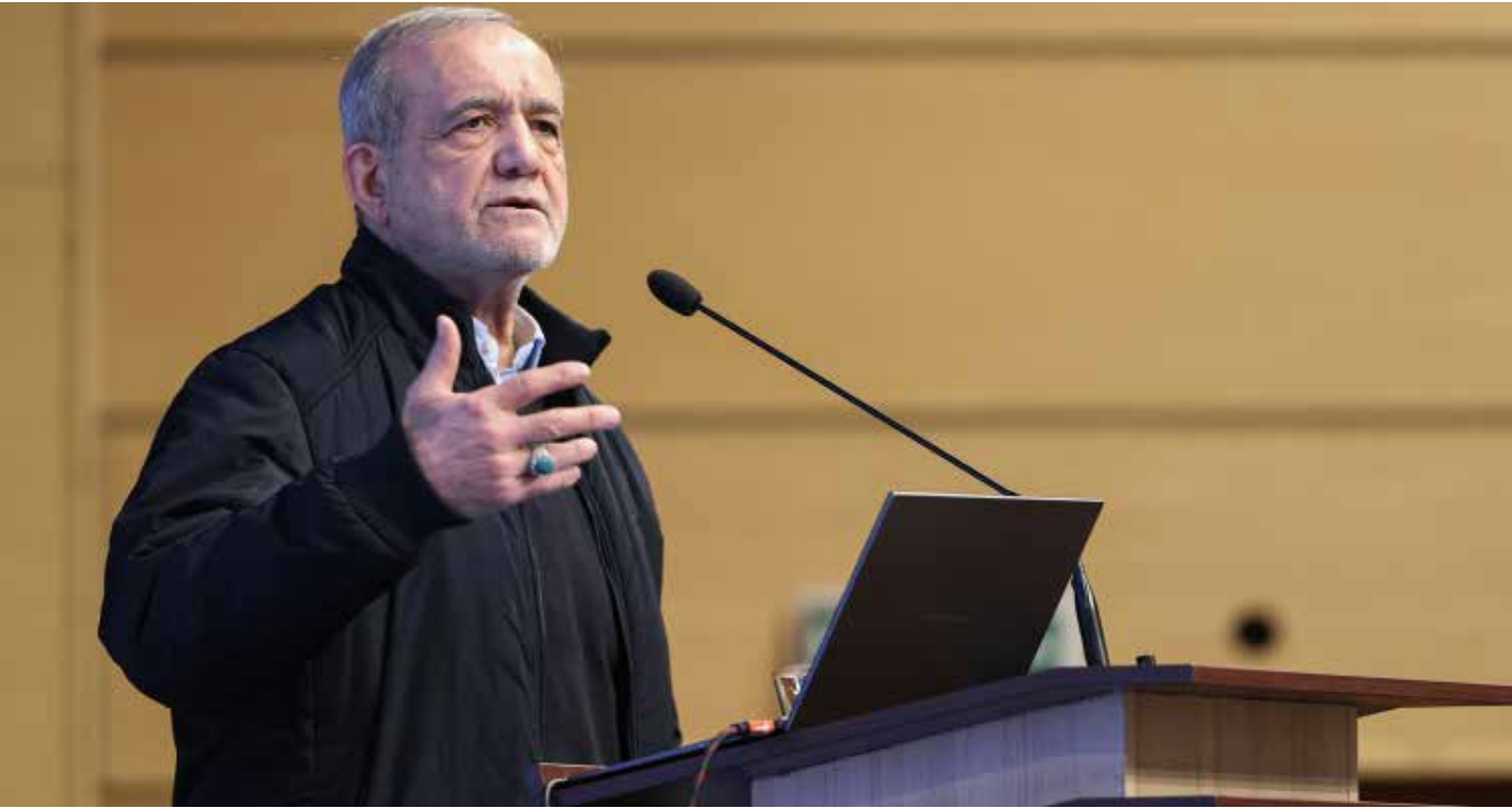
President Masoud Pezeshkian addresses a national conference on "Planning, Budgeting, and Performance-Based Payment" in Tehran on January 20, 2026.

Economy Desk Iranian President Masoud Pezeshkian said on Tuesday that resolving citizens' livelihood challenges is the top priority