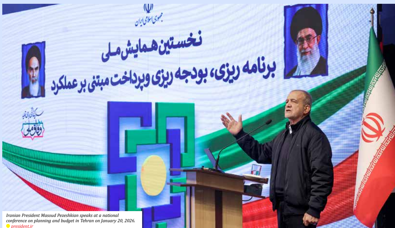
Iranian President Masoud Pezeshkian speaks at a national conference on planning and budget in Tehran on January 20, 2026.