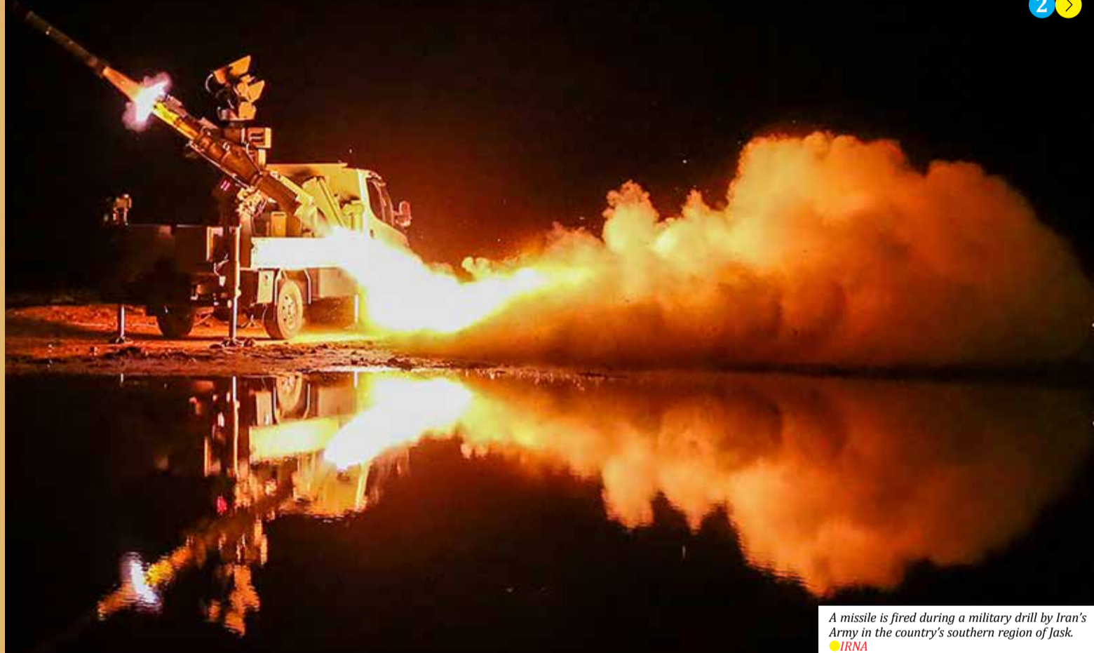
A missile is fired during a military drill by Iran's Army in the country's southern region of Jask.