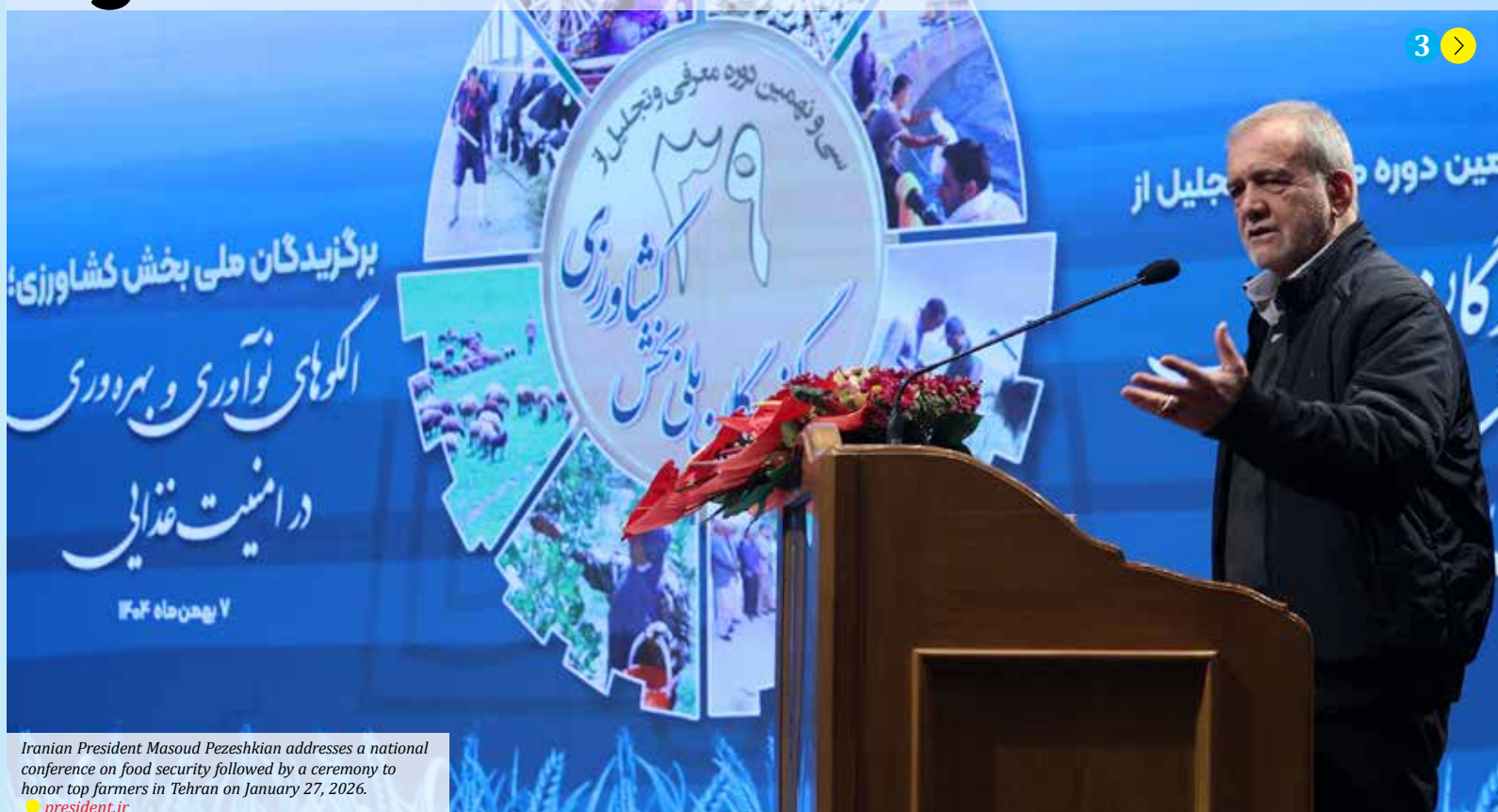
Iranian President Masoud Pezeshkian addresses a national conference on food security followed by a ceremony to honor top farmers in Tehran on January 27, 2026.