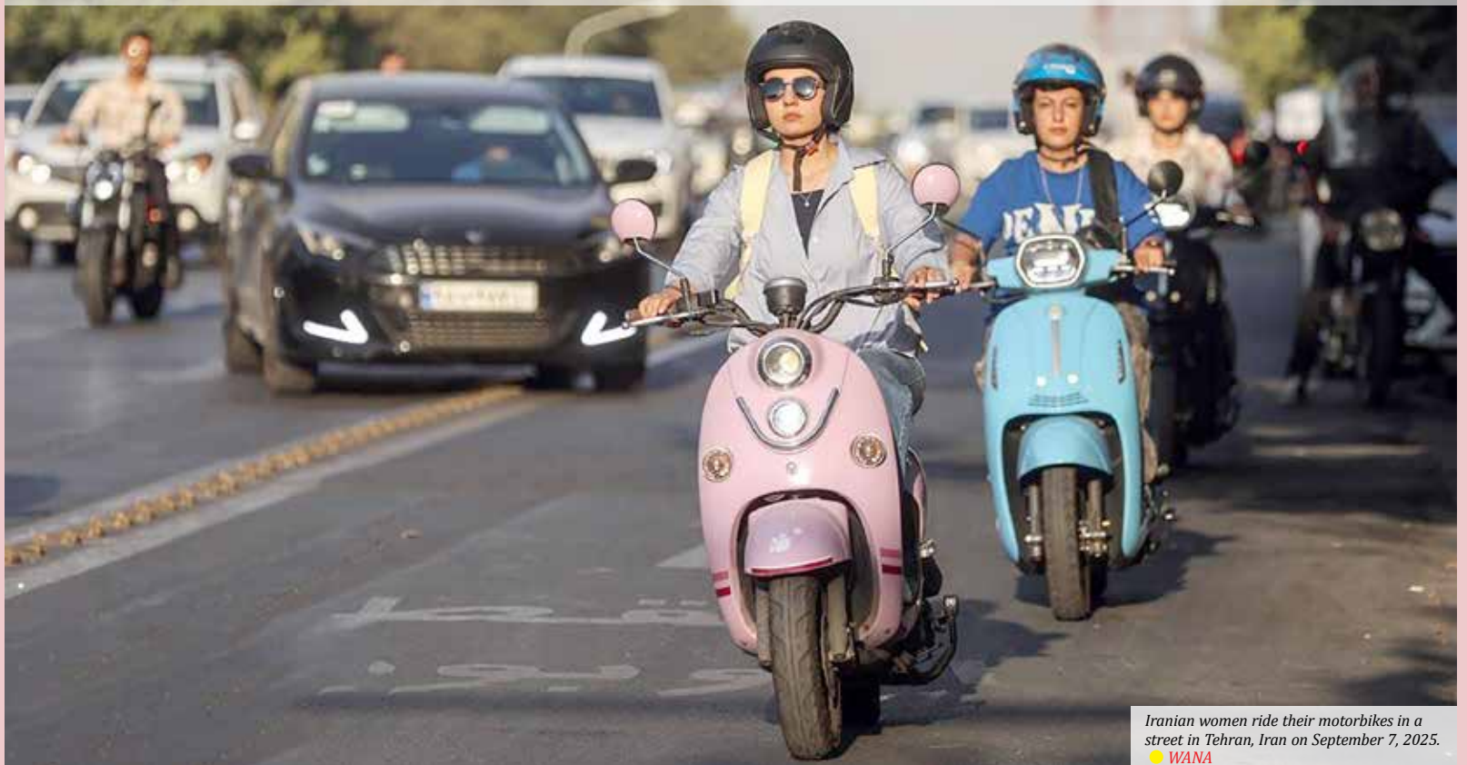
Iranian women ride their motorbikes in a street in Tehran, Iran on September 7, 2025.