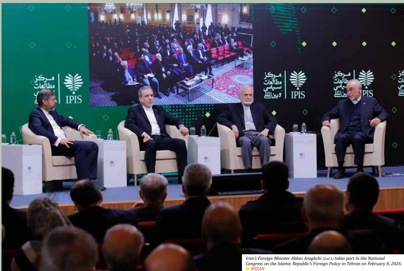
Iran's Foreign Minister Abbas Araghchi (2nd L) takes part in the National Congress on the Islamic Republic's Foreign Policy in Tehran on February 8, 2026.